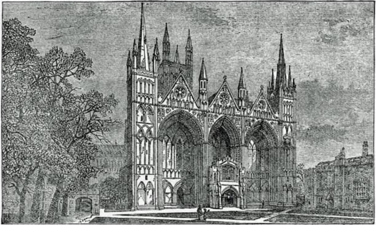
Peterborough Cathedral—West Front