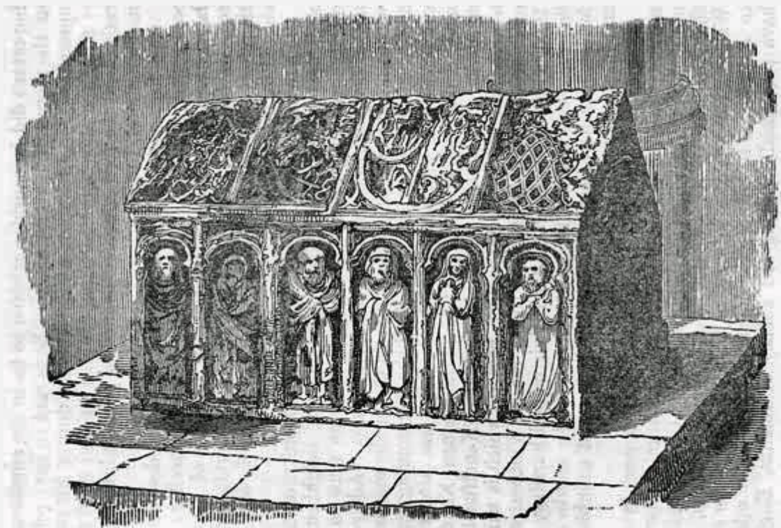
Ancient Monumental Stone in the Cathedral.

It was in 966 that the monastery of Medeshamstede was rebuilt after the old model, at the instigation of Athelwold, who was at that time Bishop of Winchester. King Edgar assisted in the re-construction of the monastery; and so important did he consider religion to be in the amelioration of the morals of his subjects, that he is said to have rebuilt upwards of forty religious establishments during his reign.