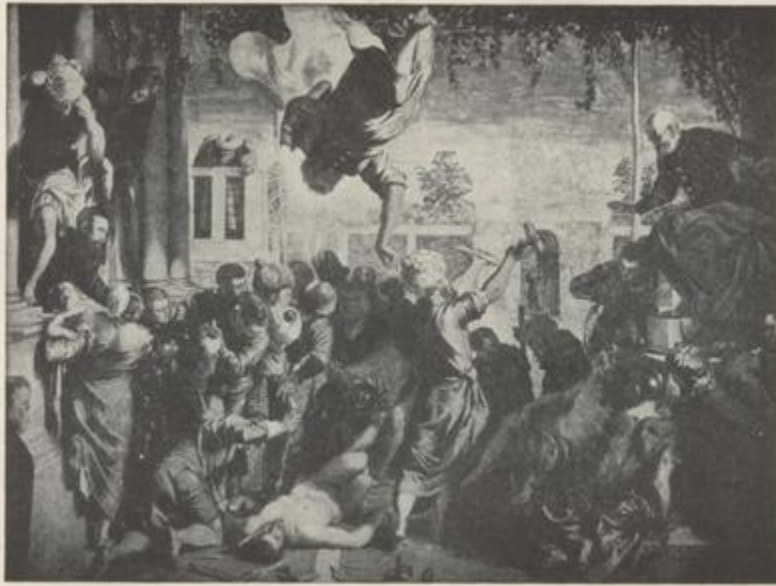
THE MIRACLE OF ST. MARK— Tintoretto

Notice the portrait of the artist himself at the lower corner on the left hand side