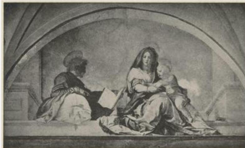
MADONNA OF THE SACK--Andrea del Sarto A fresco that still remains on the wall of the cloister in Florence, where it was painted

Throughout his life the artist longed for tenderness and encouragement from his wife, and finally, without ever receiving it, he died in a desolate way, untended even by her. After the siege of Florence there came a pestilence, and Andrea was overtaken by it. His wife, afraid that she too would become ill, would have nothing to do with him. She kept away and he died quite alone, few caring that he was dead and no one taking the trouble to follow him to his grave. Thus one of the greatest of Florentine painters lived and died. Years after his death, the artist Jacopo da Empoli, was copying Andrea's "Birth of the Virgin" when an old woman of about eighty years on her way to mass stopped to speak with him. She pointed to the beautiful Virgin's face in the picture and said: "I am that woman." And so she was--the widow of the great Andrea. Though she had treated him so cruelly, she was glad to have it known that she was the widow of the dead genius.