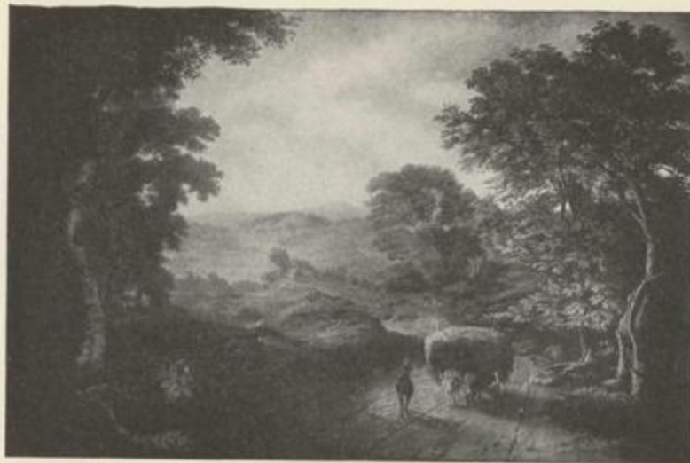
THE BERKSHIRE HILLS— Inness Observe the fine perspective of the distant high- lands, and the little cottage nestling under the trees

Robert Cheseman with his Falcon-- Hans Holbein, the Younger