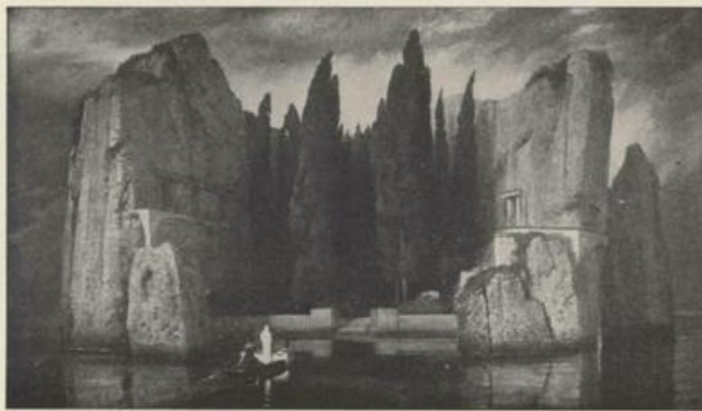
THE ISLE OF THE DEAD— Böcklin A sombre scene, befitting a sombre subject. The straight lines are specially noticeable.