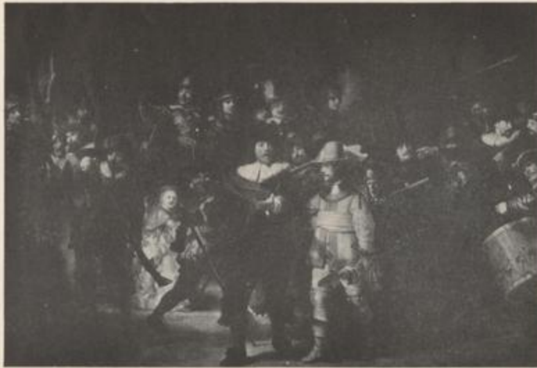
THE NIGHT WATCH--Rembrandt

The faces did not come out strongly enough from the artist's glorious shadows to please his patrons, who had bespoken portraits