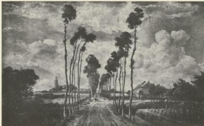
THE AVENUE, MIDDLEHARNIS, HOLLAND— Hobbema The trees may typify a land denuded of former greatness, but to the right is a thrifty Dutch homestead and garden, to the left a suggestive church spire

The Meeting of St. John and St. Anna at Jerusalem-- Giotto (Di Bordone)