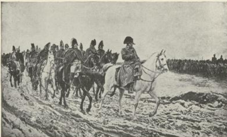
RETREAT FROM MOSCOW— Meissonier

Horses and men alike have a dejected air, but notice the set face of Napoleon