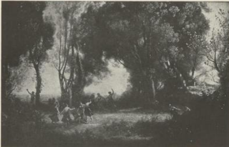
DANCE OF THE NYMPHS—Corot

The Holy Night--Correggio (Antonio Allegri)