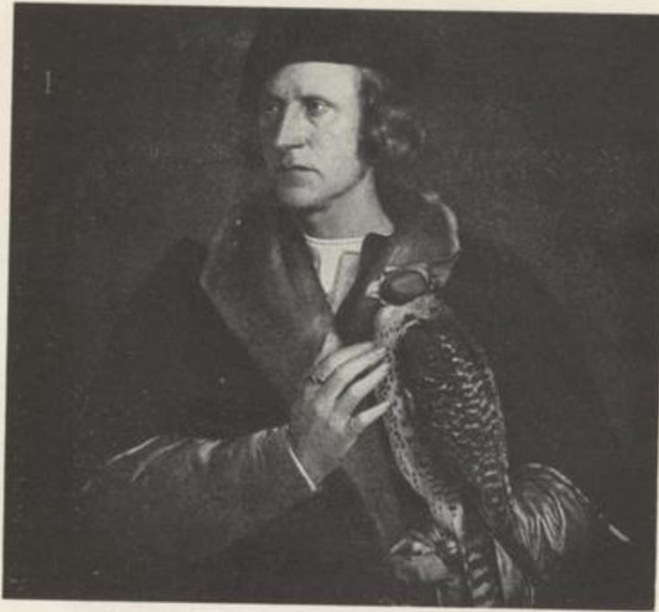
ROBERT CHESEMAN OF DORMANSWELL— Holbein Notice the delicacy of the falconer's hand, the hood and bell on the bird

Robert Cheseman with his Falcon-- Hans Holbein, the Younger