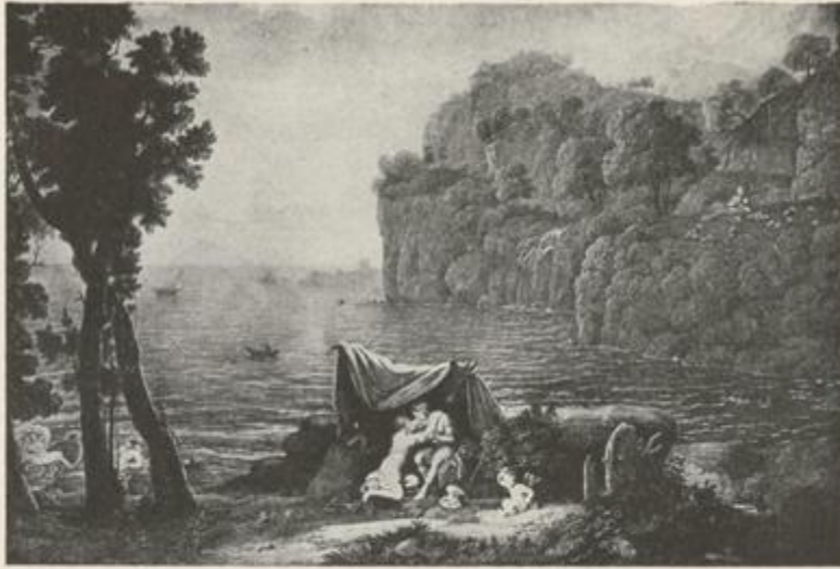
ACIS AND GALATEA— Lorrain

Polyphemus on the cliff seems too large for his sheep, but he is a giant who will soon hurl a mountain on the lovers