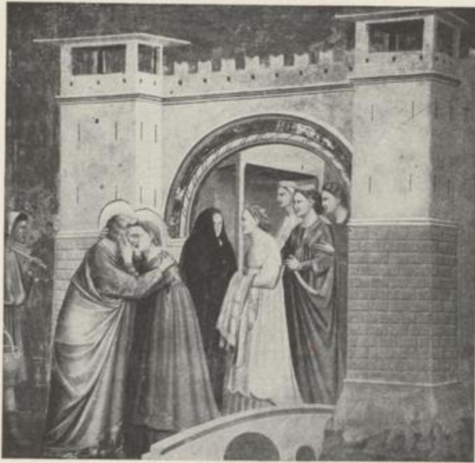
MEETING OF ST. JOHN AND ST. ANNA— Giotto A fourteenth century fresco, showing great advance on the few paintings that preceded it

The Meeting of St. John and St. Anna at Jerusalem-- Giotto (Di Bordone)