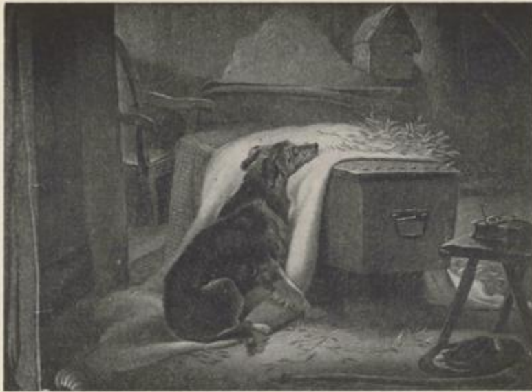
THE OLD SHEPHERD'S CHIEF MOURNER— Landseer The dog in joy and the dog in sorrow, with his own kind, with human kind—Sir Edwin painted them all

The Old Shepherd's Chief Mourner-- Sir Edwin Henry Landseer