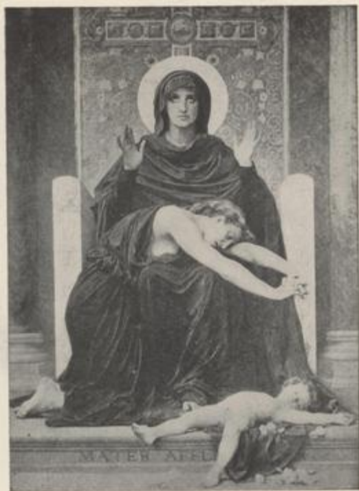
THE VIRGIN AS CONSOLER— Bouguereau The mother of the dead child seems to need all the help from heaven the Virgin Mary can bring down

The Virgin as Consoler--Wm. Adolphe Bouguereau