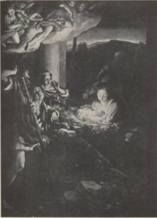
THE HOLY NIGHT—Correggio

Another name for the picture is "The Adoration of the Shepherds," which seems to explain it better.