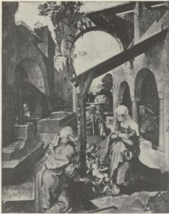
THE NATIVITY— Dürer

Compare this with the Italian pictures of sacred subjects. The feeling is quite different.