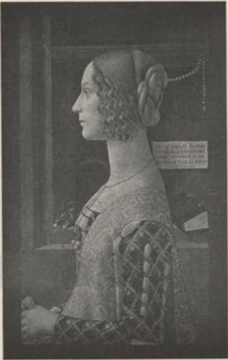
GIOVANNA DEGLI ALBIZI-- Ghirlandajo The tablet states that if art could have painted her mind and manner, no picture on earth would have been more beautiful

Portrait of Giovanna degli Albizi-- Ghirlandajo (Domenico Bigordi)