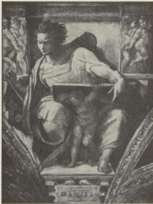
DANIEL— Michelangelo One of the frescoes on the ceiling of the Sistine Chapel at Rome that illustrate the whole Bible