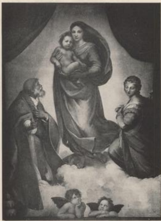
THE SISTINE MADONNA-- Raphael

By many critics considered to be the greatest painting in the world