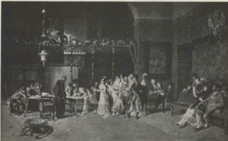
THE SPANISH MARRIAGE— Fortuny

The signing of the register, elsewhere a solemn occasion, this artist has turned into a scene of gay frivolity.