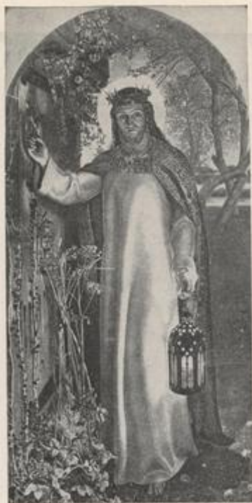
THE LIGHT OF THE WORLD—Holman Hunt

Perhaps the most popular picture of a sacred subject ever painted. It is in Keble College, Oxford