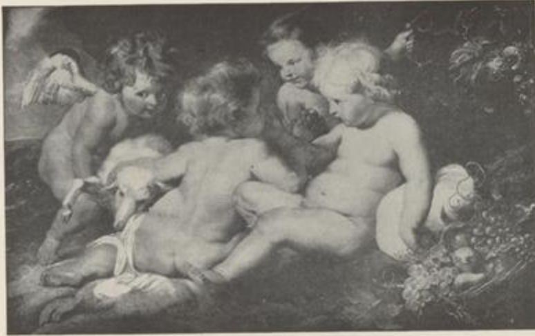
THE INFANT JESUS AND ST. JOHN— Rubens The artist famed for his Venus festivals, his battles, his mournful sacred scenes can also portray the playfulness of childhood

The Infant Jesus and St. John-- Peter Paul Rubens