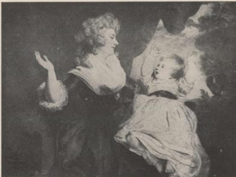
THE DUCHESS OF DEVONSHIRE AND HER DAUGHTER--Reynolds

Notice the baby's chubby feet, and the lovely arm of the mother