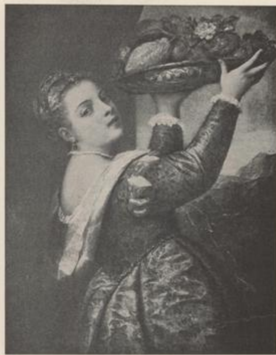
THE ARTIST'S DAUGHTER— Titian

The Miracle of St. Mark-- Tintoretto ( Jacopo Robusti )