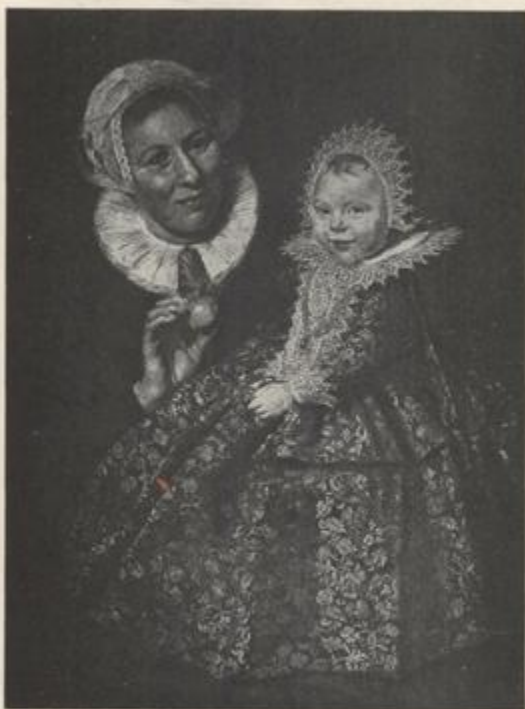
THE NURSE AND THE CHILD-- Franz Hals Probably the artist kept these two amused with some of his drolleries while he painted their picture

Portrait of Giovanna degli Albizi-- Ghirlandajo (Domenico Bigordi)