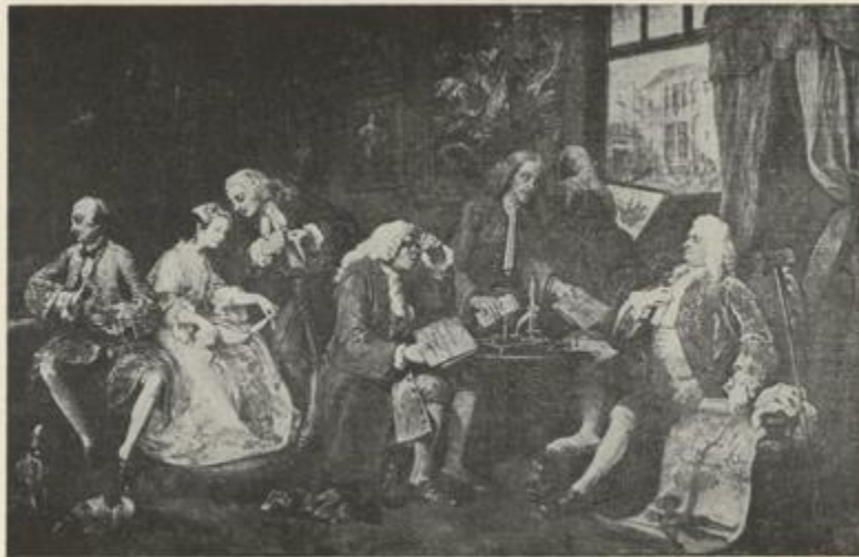
THE MARRIAGE CONTRACT—Hogarth

The first act in a great moral drama of five acts called "Marriage à la Mode." The series hangs in the National Gallery, London