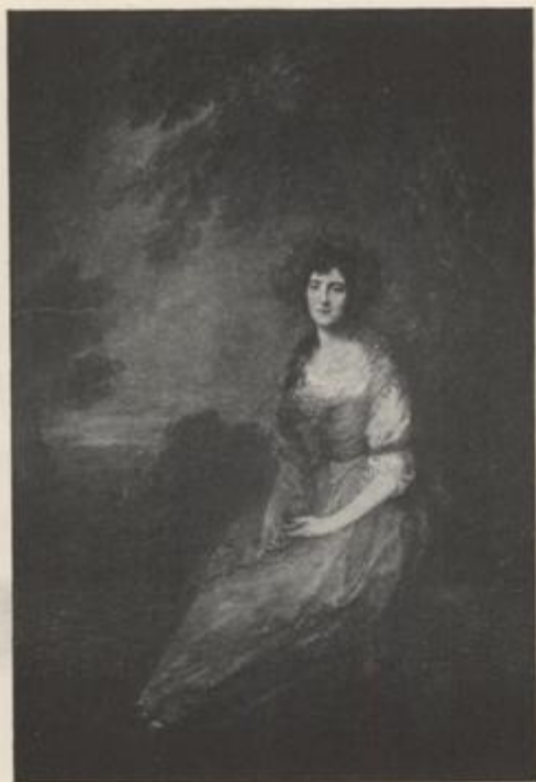
MRS. RICHARD BRINSLEY SHERIDAN— Gainsborough Notice the sweetly pensive expression of the face, the lovely hand and arm, and the transparency of the draperies

Mrs. Richard Brinsley Sheridan-- Thomas Gainsborough