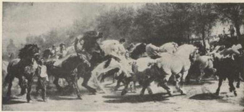
THE HORSE FAIR— Rosa Bonheur

A famous canvas that can be seen in the Metropolitan Art Gallery, New York City