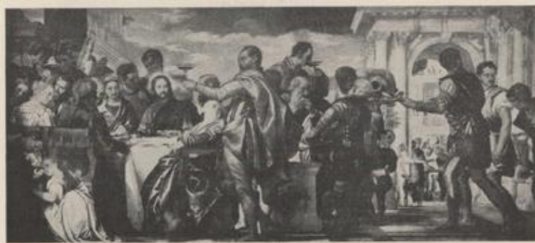
THE MARRIAGE AT CANA— Veronese This is not like the humble home in which the Biblical wedding occurred, but it is a fine picture nevertheless

Equestrian Portrait of Don Balthasar Carlos-- Velasquez ( Diego Rodriguez de Silva )