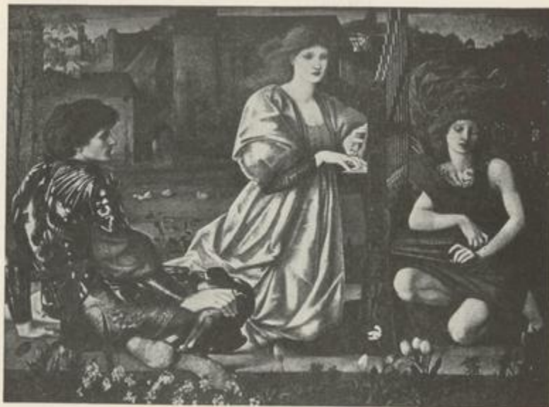
THE LOVE SONG— Burne-Jones A song without words it seems to be, and directed by the lady player to the youth at her right

The Virgin as Consoler--Wm. Adolphe Bouguereau