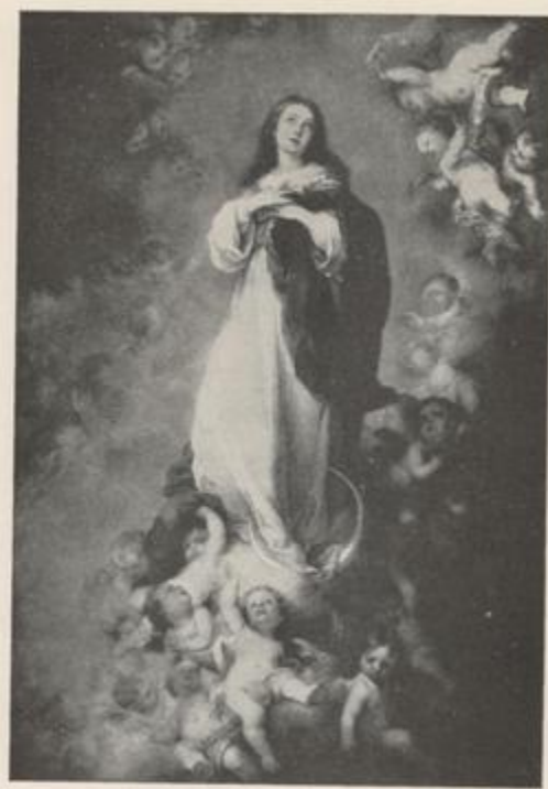
IMMACULATE CONCEPTION—Murillo The artist has seized an opportunity to paint the happy little children he loved

The Immaculate Conception--Murillo (Bartolomé Estéban)