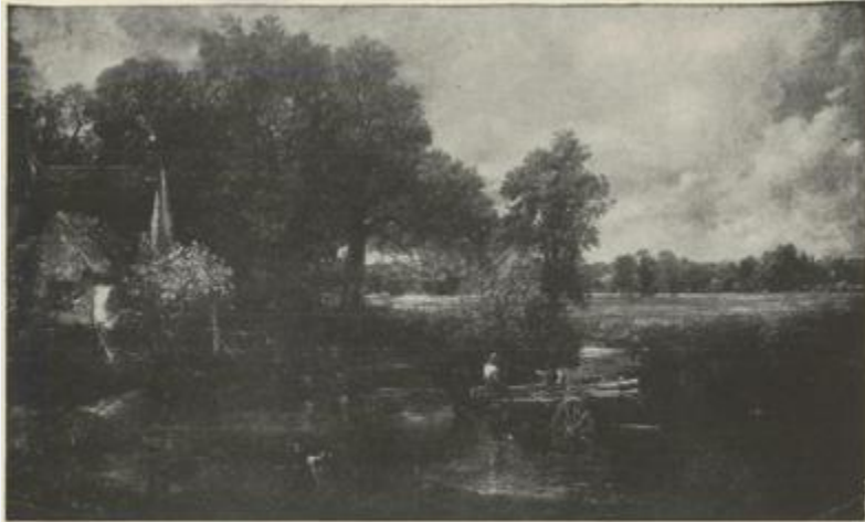
THE HAY-WAIN— Constable

The hay-cart is not the most conspicuous thing in this picture which has been called by other names—"Landscape," "Noon," etc.