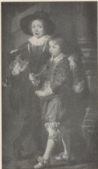
THE ARTIST'S TWO SONS— Rubens

The younger one holds a perch for his pet bird which can fly off only the length of its string