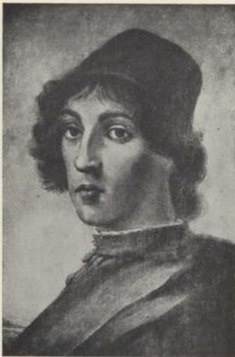
ARTIST'S PORTRAIT— Masaccio The most original artist between Giotto and Raphael. He died before he was thirty

The Old Shepherd's Chief Mourner-- Sir Edwin Henry Landseer