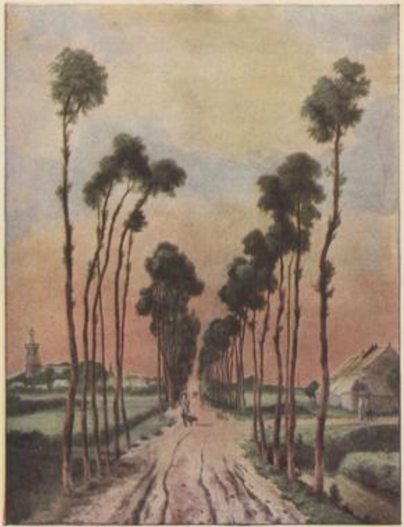
The Avenue, Middleharnis, Holland— Hobbema

The Avenue, Middleharnis, Holland-- Hobbema