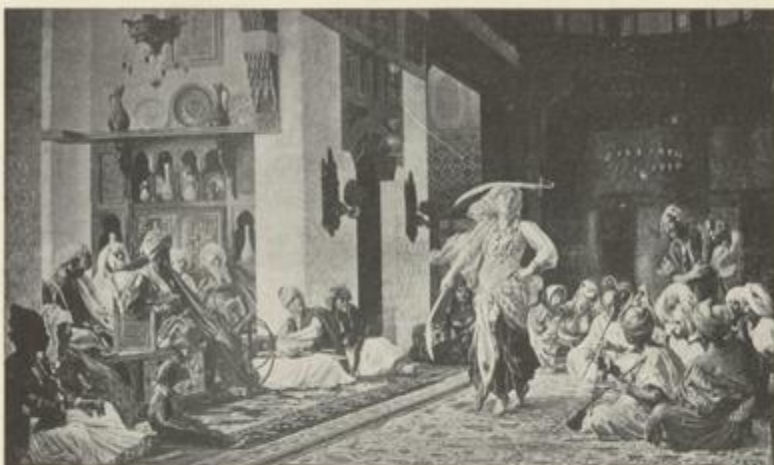
THE SWORD DANCE— Gérôme Compare with Scottish Sword Dance, where Highlander tiptoes back and forth over sword to music of bagpipes

Mrs. Richard Brinsley Sheridan-- Thomas Gainsborough