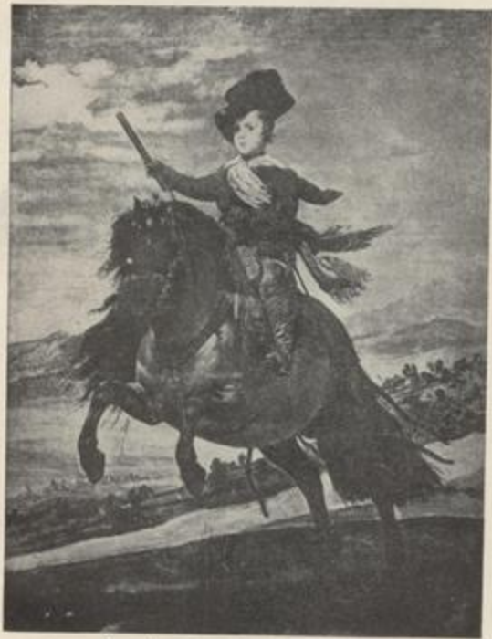
DON BALTHASAR CARLOS— Velasquez This fine little prince was heir to the Spanish throne, but he did not live to occupy it

Equestrian Portrait of Don Balthasar Carlos-- Velasquez ( Diego Rodriguez de Silva )