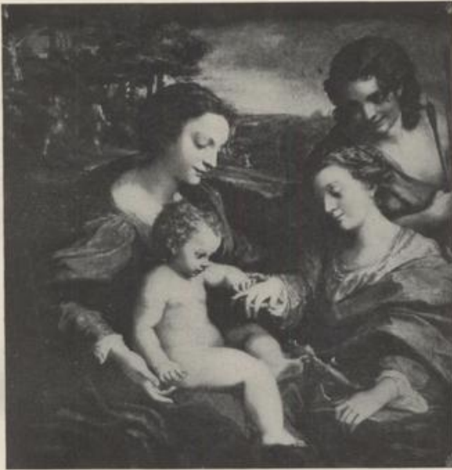
MYSTIC MARRIAGE OF ST. CATHERINE— Correggio The Saint of Alexandria considered herself the bride of Christ, having been married to him in a vision

The Mystic Marriage of St. Catherine-- Correggio