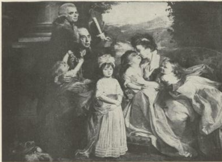
A FAMILY PICTURE— Copley

The prim little lady in front seems more dressed up than her mother