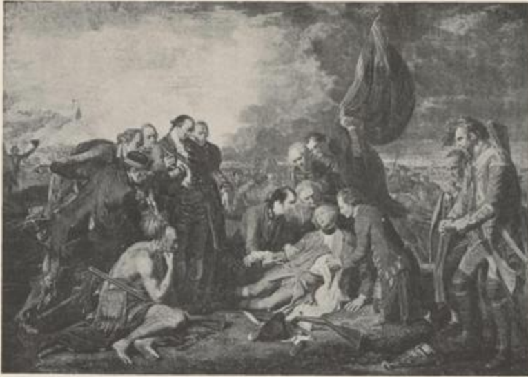
THE DEATH OF WOLFE— West

The hero is dying at the very moment when he has won a continent for the Anglo-Saxon race