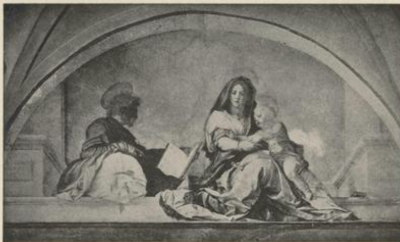
MADONNA OF THE SACK-- Andrea del Sarto

The Avenue, Middleharnis, Holland-- Hobbema