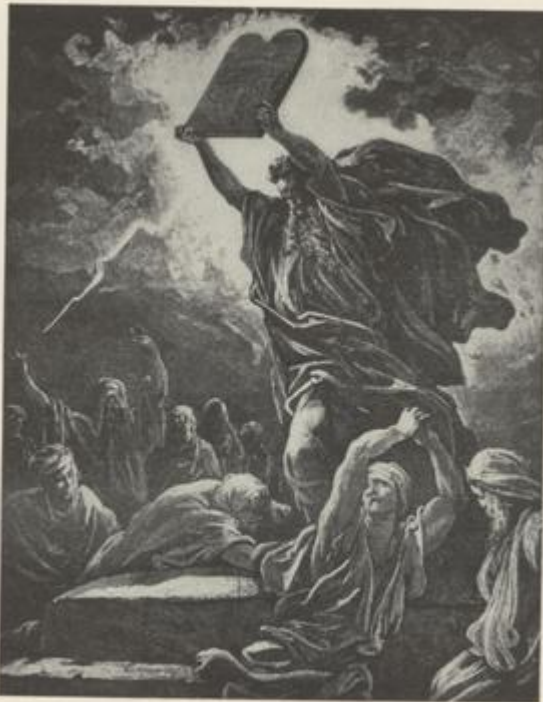
MOSES BREAKING THE TABLETS OF THE LAW— Doré This is one of the illustrations of the Doré Bible, published in 1865

The Mystic Marriage of St. Catherine-- Correggio