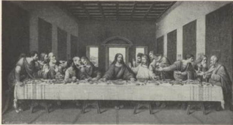
THE LAST SUPPER--Leonardo da Vinci

Christ has just said "One of you shall betray me," and the disciples are asking "Is it I?" "Is it I?"