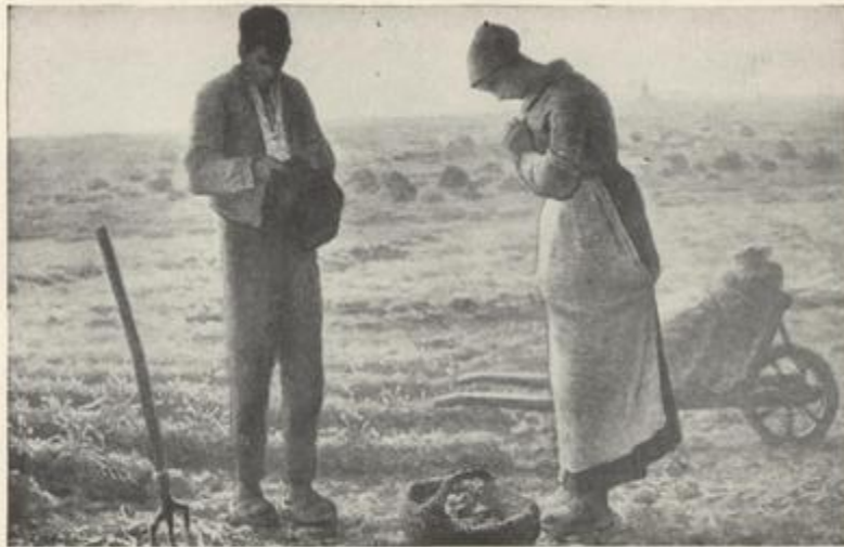
THE ANGELUS—Millet The sound of the bell travels far on the still air of evening, from the church spire on the horizon