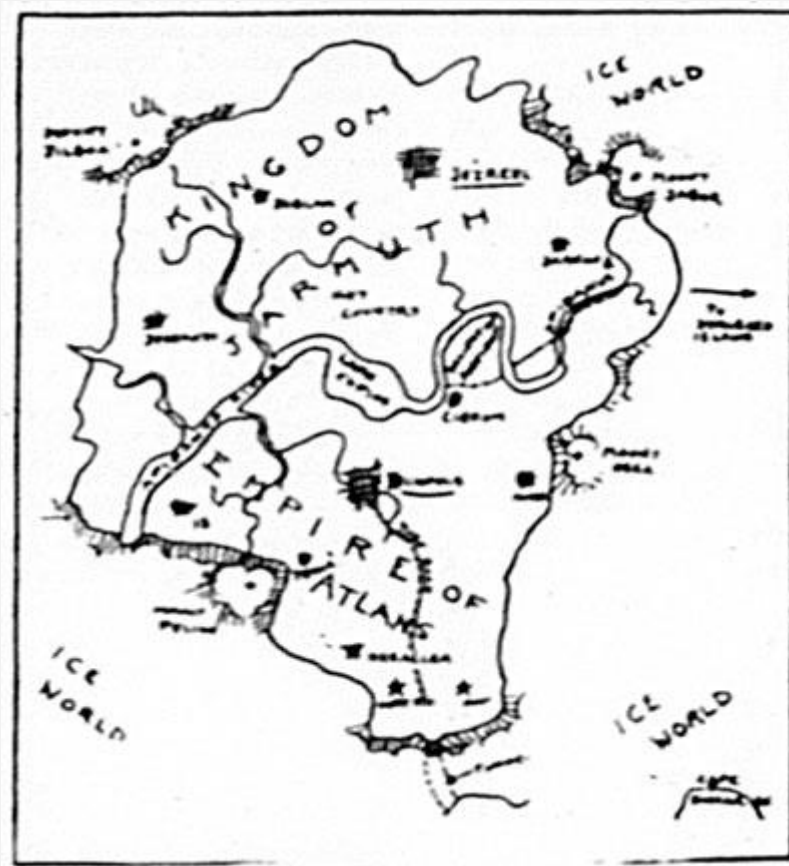
Map of Jarmuth and Atlans

A chorus of variously opined voices broke out, while Nelson with an eye to possible violence stood ready.