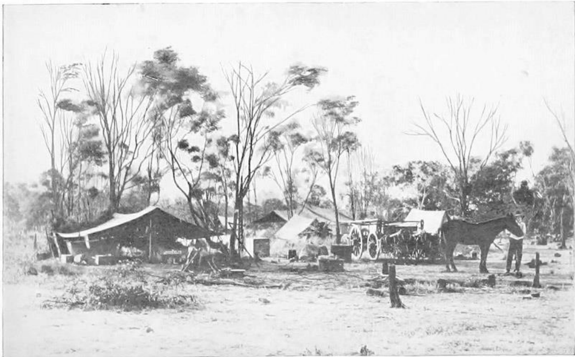
THE LINE PARTY CAMPS.