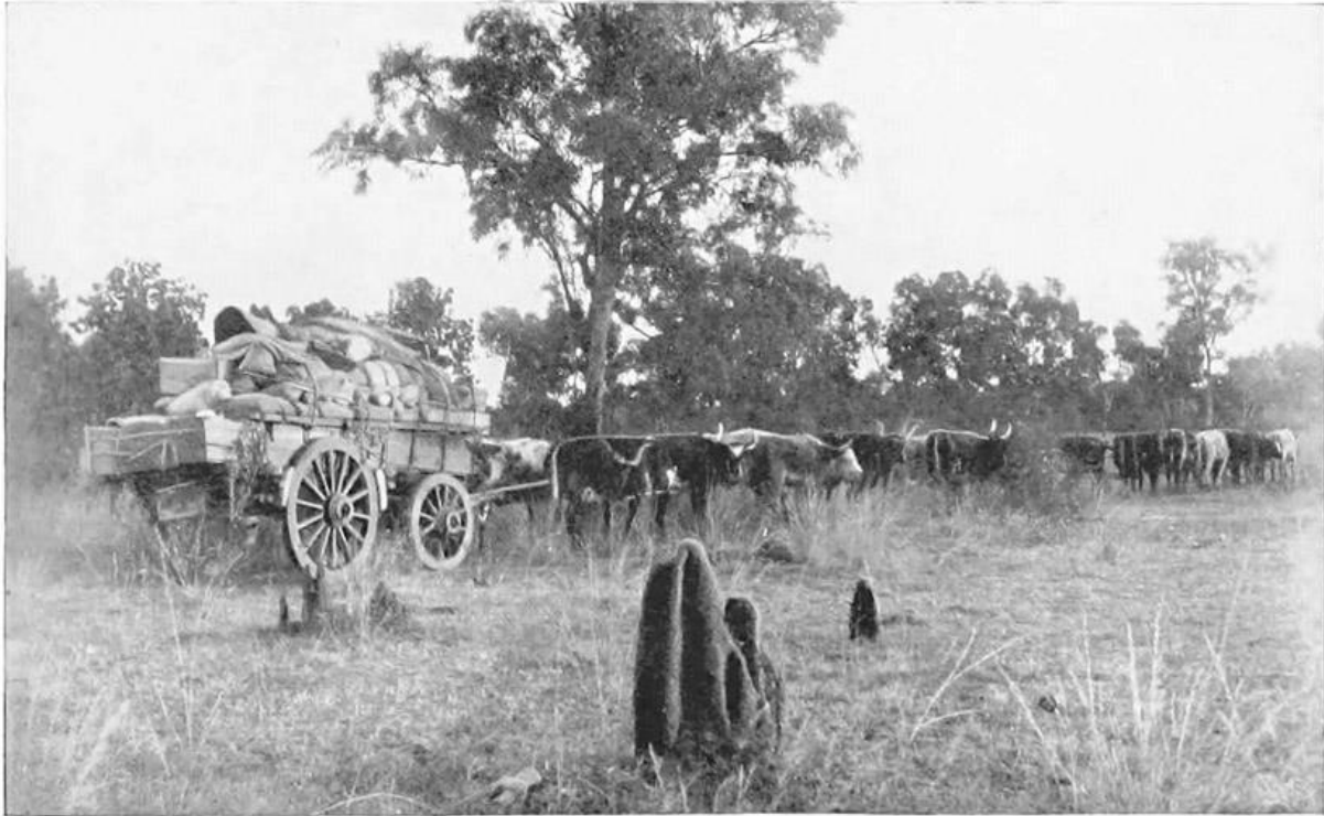
ONE OF THE BULLOCK WAGGONS.