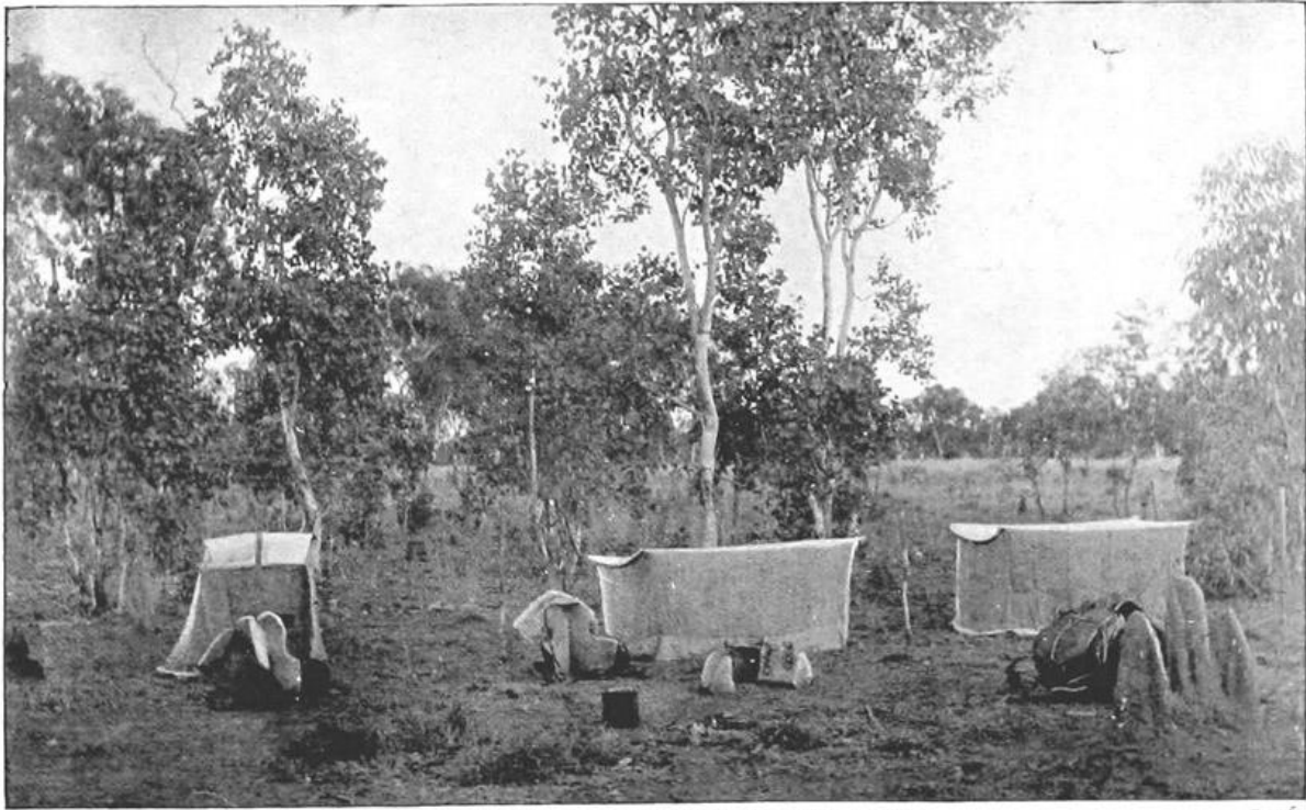
A NIGHT CAMP IN THE NEVER-NEVER.