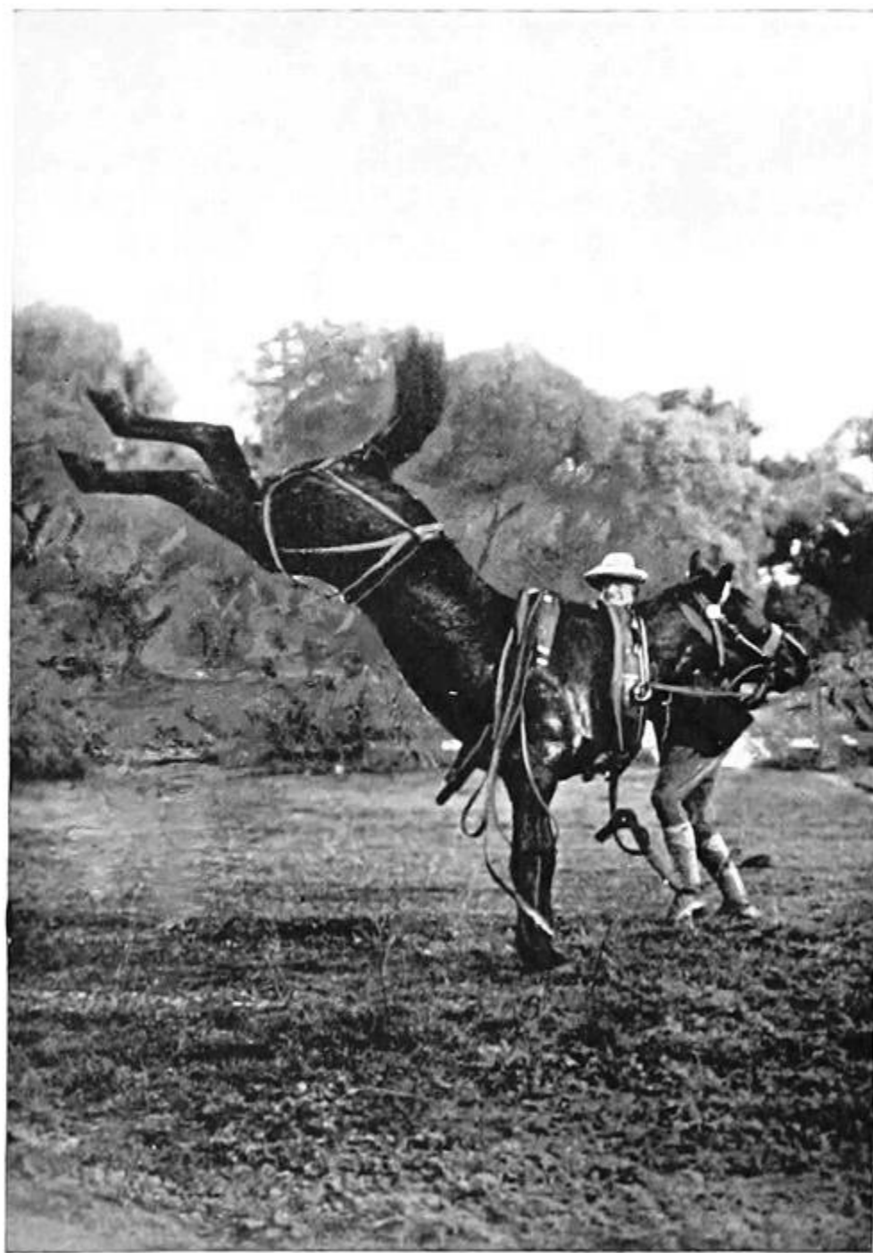
THE QUIET STOCKMAN HANDLING A KICKER.