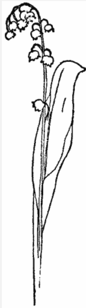
Lad and Lassie