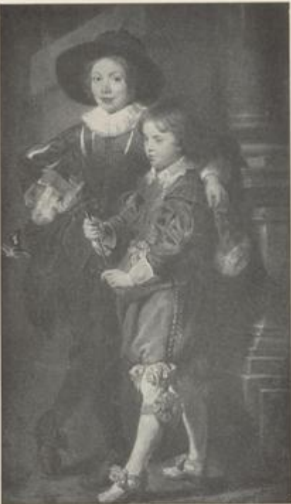
THE ARTIST'S TWO SONS— Rubens

The younger one holds a perch for his pet bird which can fly off only the length of its string