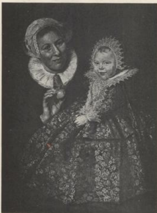
THE NURSE AND THE CHILD-- Franz Hals Probably the artist kept these two amused with some of his drolleries while he painted their picture

Portrait of Giovanna degli Albizi-- Ghirlandajo (Domenico Bigordi)