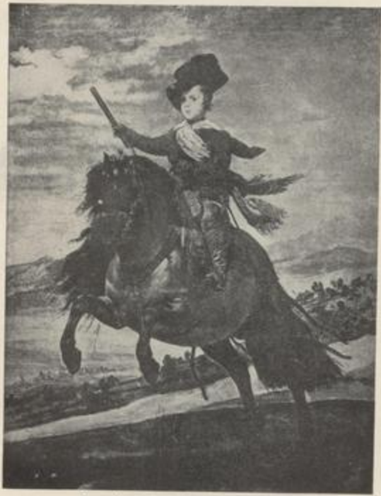
DON BALTHASAR CARLOS— Velasquez This fine little prince was heir to the Spanish throne, but he did not live to occupy it

Equestrian Portrait of Don Balthasar Carlos-- Velasquez (Diego Rodriguez de Silva)