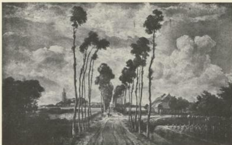
THE AVENUE, MIDDLEHARNIS, HOLLAND— Hobbema The trees may typify a land denuded of former greatness, but to the right is a thrifty Dutch homestead and garden, to the left a suggestive church spire

The Meeting of St. John and St. Anna at Jerusalem-- Giotto (Di Bordone)