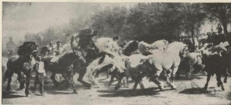
THE HORSE FAIR— Rosa Bonheur

A famous canvas that can be seen in the Metropolitan Art Gallery, New York City