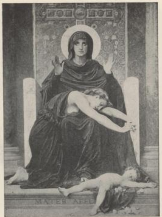
THE VIRGIN AS CONSOLER— Bouguereau The mother of the dead child seems to need all the help from heaven the Virgin Mary can bring down

The Virgin as Consoler--Wm. Adolphe Bouguereau