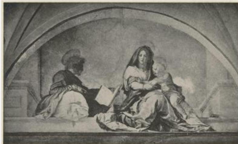
MADONNA OF THE SACK--Andrea del Sarto

Throughout his life the artist longed for tenderness and encouragement from his wife, and finally, without ever receiving it, he died in a desolate way, untended even by her. After the siege of Florence there came a pestilence, and Andrea was overtaken by it. His wife, afraid that she too would become ill, would have nothing to do with him. She kept away and he died quite alone, few caring that he was dead and no one taking the trouble to follow him to his grave. Thus one of the greatest of Florentine painters lived and died. Years after his death, the artist Jacopo da Empoli, was copying Andrea's "Birth of the Virgin" when an old woman of about eighty years on her way to mass stopped to speak with him. She pointed to the beautiful Virgin's face in the picture and said: "I am that woman." And so she was--the widow of the great Andrea. Though she had treated him so cruelly, she was glad to have it known that she was the widow of the dead genius.