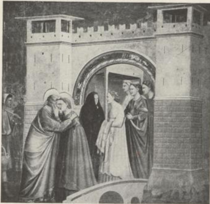
MEETING OF ST. JOHN AND ST. ANNA— Giotto A fourteenth century fresco, showing great advance on the few paintings that preceded it

The Meeting of St. John and St. Anna at Jerusalem-- Giotto (Di Bordone)