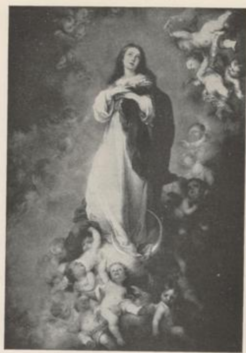
IMMACULATE CONCEPTION—Murillo The artist has seized an opportunity to paint the happy little children he loved

The Immaculate Conception--Murillo (Bartolomé Estéban)