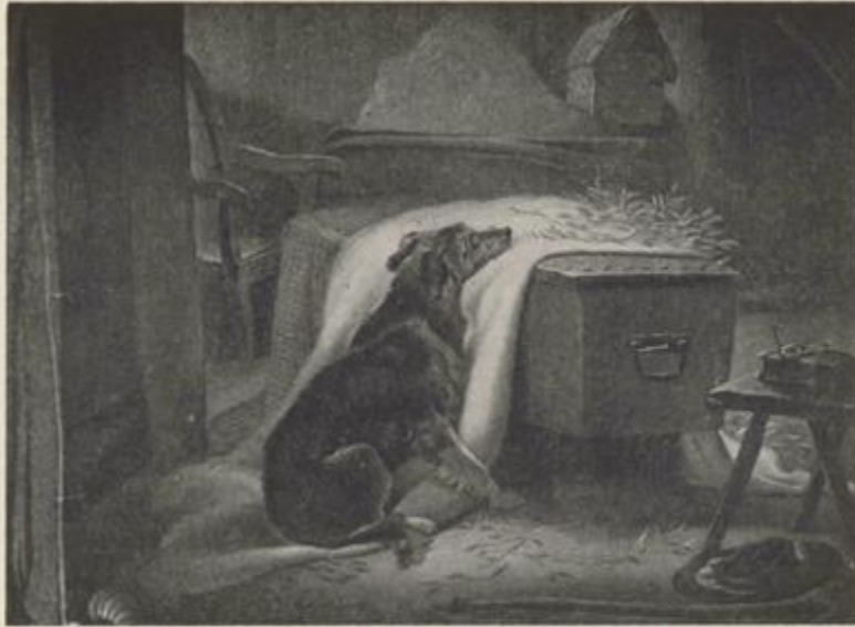
THE OLD SHEPHERD'S CHIEF MOURNER— Landseer The dog in joy and the dog in sorrow, with his own kind, with human kind—Sir Edwin painted them all

The Old Shepherd's Chief Mourner-- Sir Edwin Henry Landseer