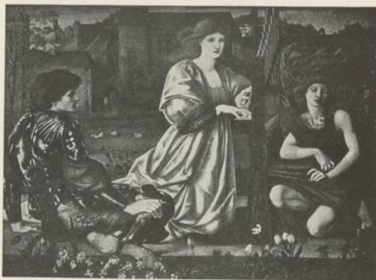
THE LOVE SONG— Burne-Jones A song without words it seems to be, and directed by the lady player to the youth at her right

The Virgin as Consoler--Wm. Adolphe Bouguereau