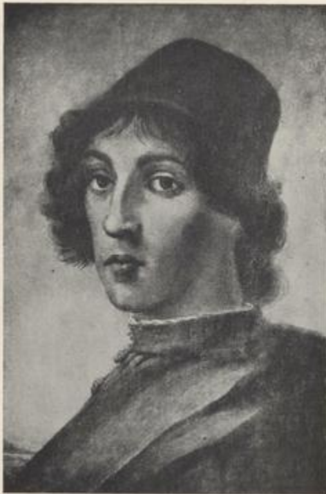
ARTIST'S PORTRAIT— Masaccio The most original artist between Giotto and Raphael. He died before he was thirty

The Old Shepherd's Chief Mourner-- Sir Edwin Henry Landseer