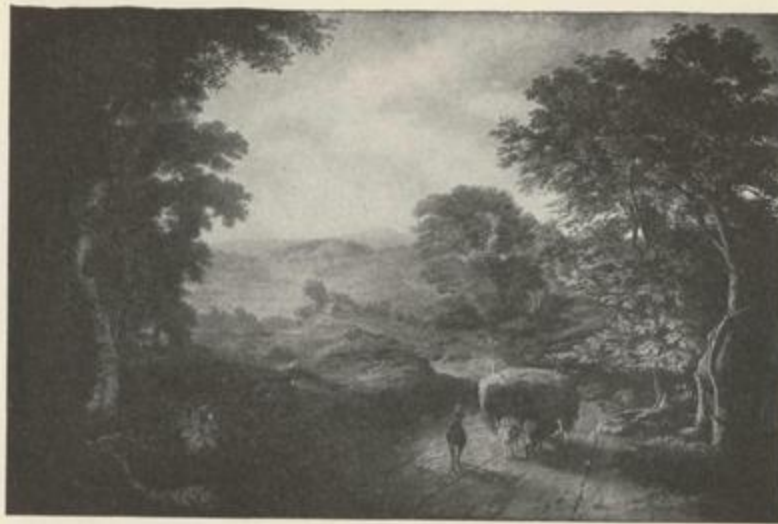
THE BERKSHIRE HILLS— Inness Observe the fine perspective of the distant high- lands, and the little cottage nestling under the trees