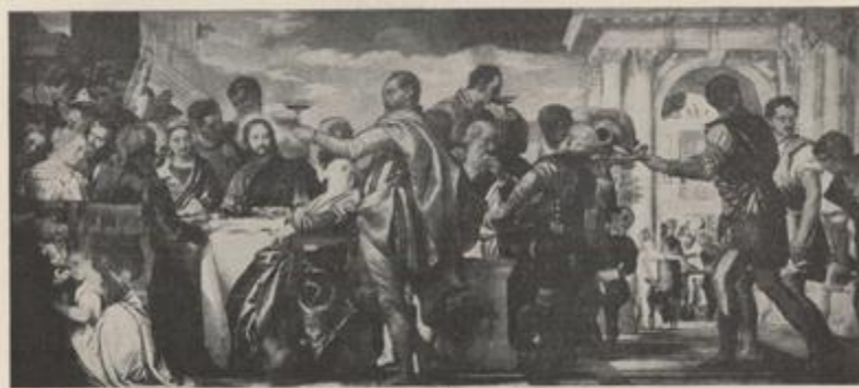
THE MARRIAGE AT CANA— Veronese This is not like the humble home in which the Biblical wedding occurred, but it is a fine picture nevertheless

Equestrian Portrait of Don Balthasar Carlos-- Velasquez (Diego Rodriguez de Silva)