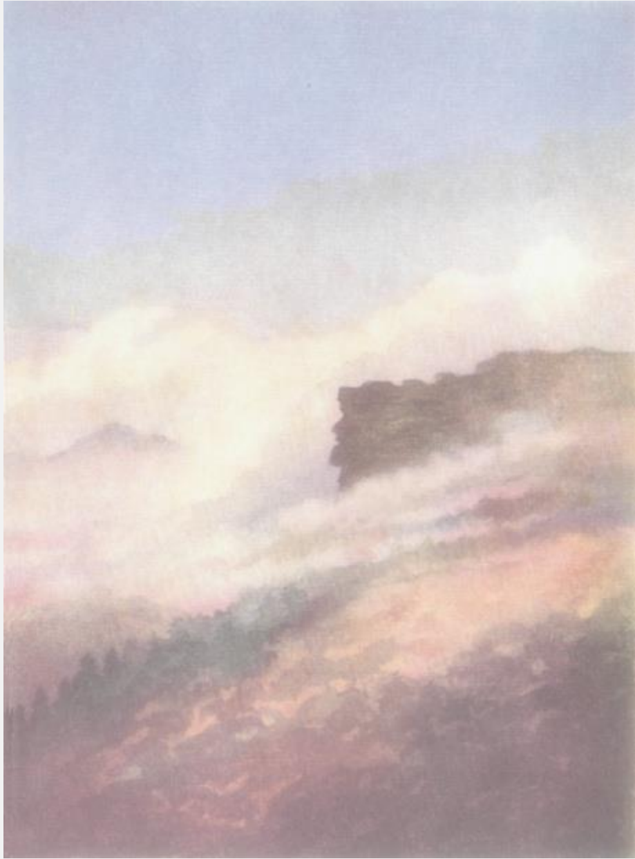
Old Man of the Mountain