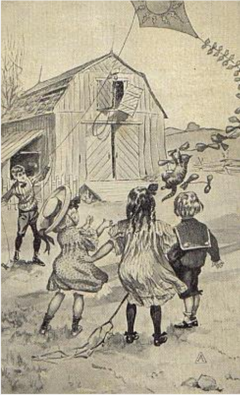
THE KITE WENT UP INTO THE AIR AND SNOOP WITH IT.— P. 177.

The common was a large one with an old disused barn at one end. Freddie and Bert took the kite to one end and Freddie held it up while Bert prepared to let out the string and "run it up," as he called it.