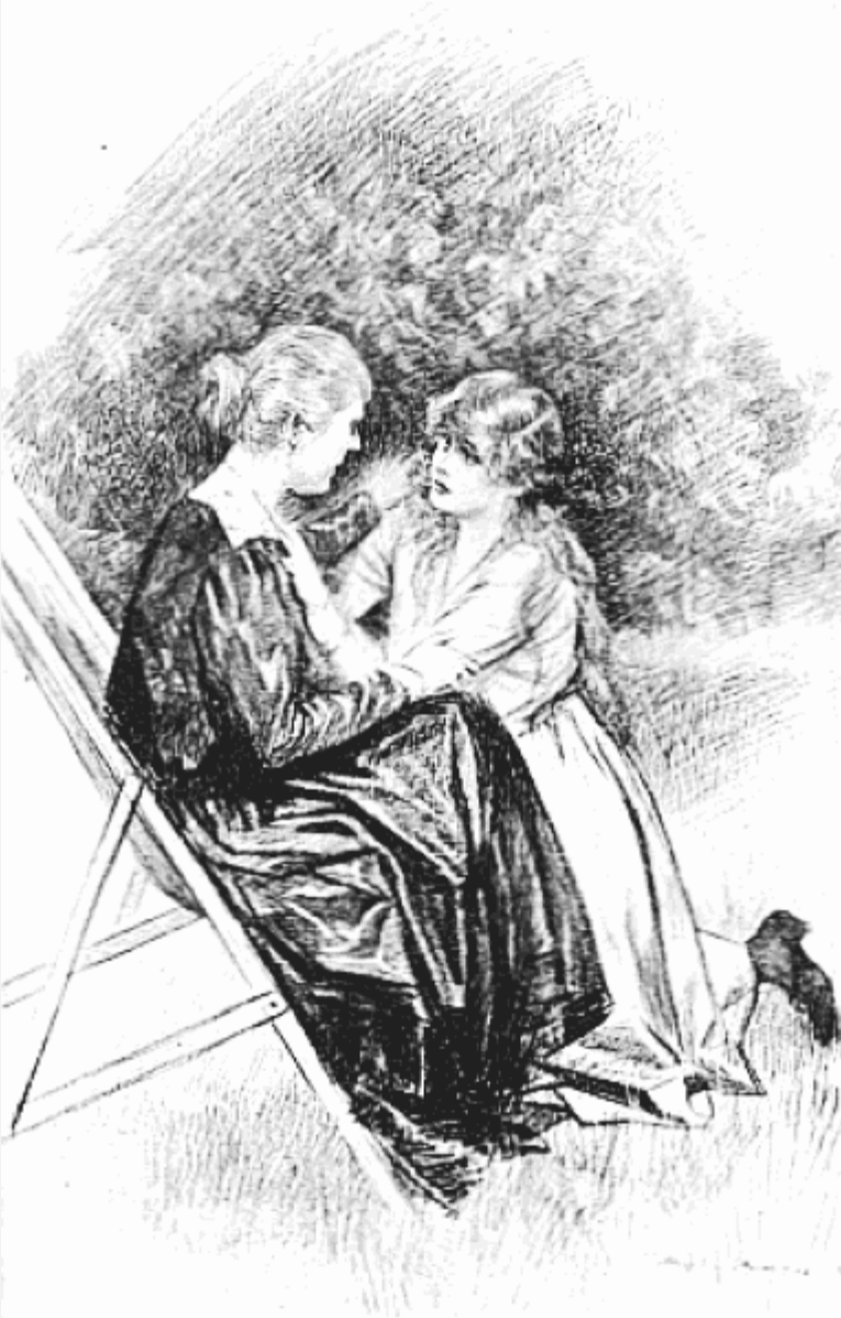
"THE BARRIER WAS DOWN AT LAST"

The barrier was down at last. For once Winona spoke straight from her heart. Miss Beach took off her pince-nez, wiped them, and put them in their case. Her hand was trembling.