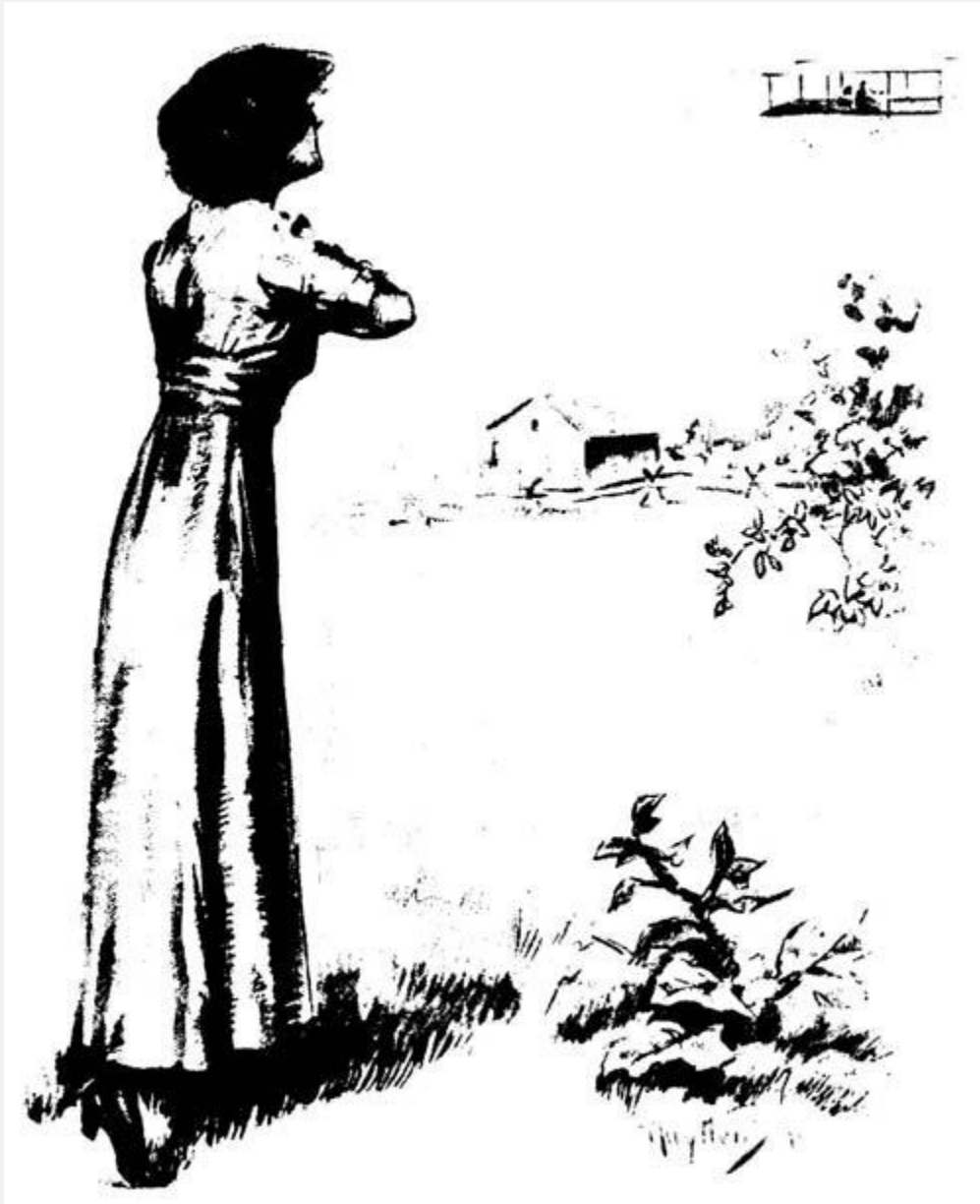
ORISSA STOOD WITH HANDS CLASPED.

Down came the aëroplane, reaching the earth on a side tilt that crushed the light planes into kindling wood and a mass of crumpled canvas. Steve rolled out, stretched his length upon the ground, and lay still.