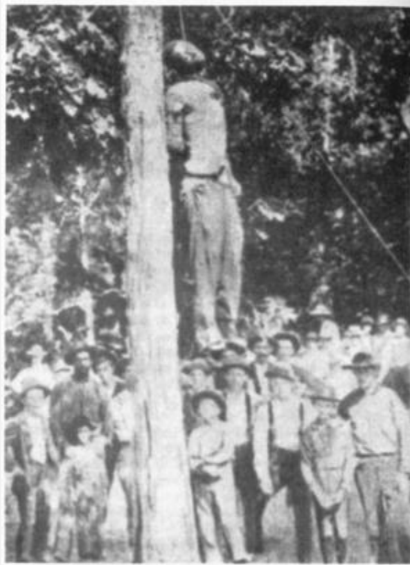
Scene of lynching at Clanton, Alabama, August 1891.