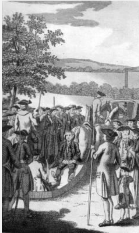
A CONDEMNED MAN DRAWN ON A SLEDGE TO TYBURN ( From the Newgate Calendar )