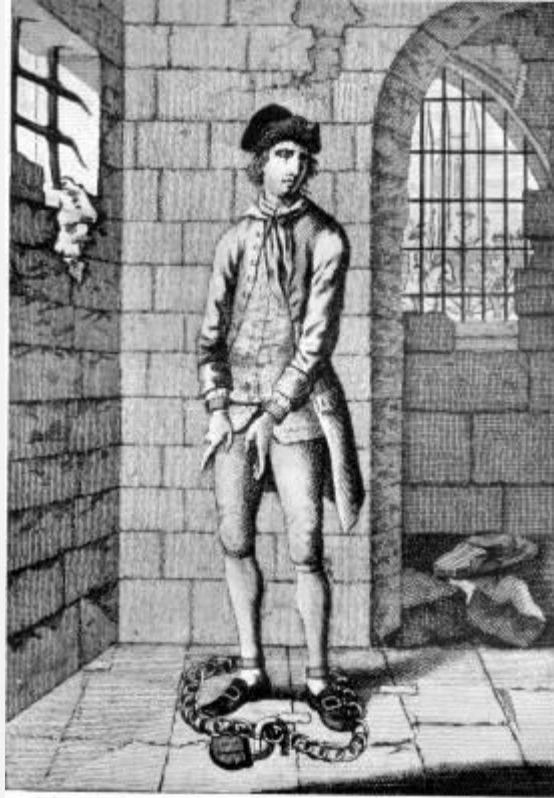
JACK SHEPPARD IN THE STONE ROOM IN NEWGATE ( From the Annals of Newgate )