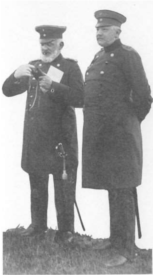
GENERALS VON HEERINGEN AND VON MOLTKE