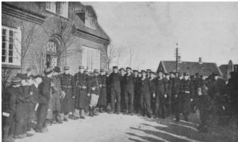
AT SKAGEN: GERMAN PRIZE CREW OF THE IGOTZ MENDI UNDER GUARD, AWAITING INTERNMENT.

With what joyful and thankful hearts did we reach home, once more to be united with our relatives and friends, who had long mourned us as dead. The shipping