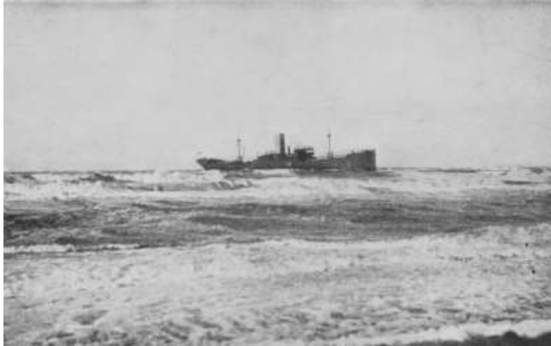
THE IGOTZ MENDI ASHORE AT SKAGEN.