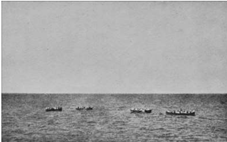
HITACHI PASSENGERS AND CREW IN LIFEBOATS AFTER THEIR SHIP HAD BEEN SHELLLED.

us had thought of the matter at all, we probably imagined we were in the safest part of the ocean. But, at three o'clock, here we were, having undergone the trying ordeal of shell-fire in the interval, drifting helplessly in lifeboats in mid-ocean, all our personal belongings left behind in what we imagined to be a sinking ship, not knowing what fate was in store for us, but naturally, remembering what we had heard of German sea outrages, dreading the very worst.