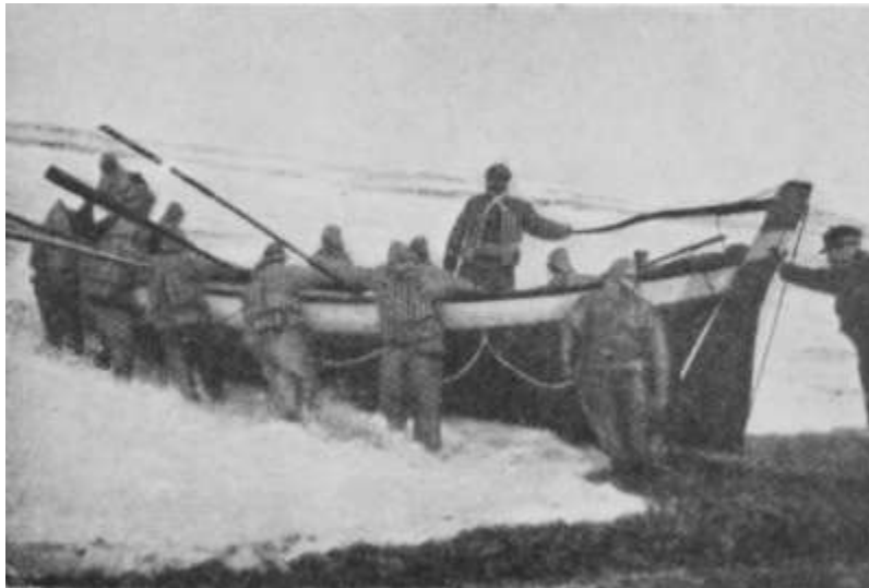
THE SKAGEN LIFEBOAT GOING OUT TO THE IGOTZ MENDI TO BRING OFF THE PRISONERS.

A fine lifeboat, manned by sturdy Danish sailors, was alongside the ship; the sea was very rough, but our ship steady, firmly embedded in the sandy bottom, and driven farther in since she stranded. The packages we had decided to save at any cost were put in our pockets, lifebelts and life-saving waistcoats once more put on, and once more we all climbed a ship's ladder, but as the lifeboat was rising and falling almost the height of the ship with the heavy seas, descent into it was not easy. One by one we dropped into the outstretched arms of the sailors as the boat rose on the crest of a wave to the bottom of the ladder. It was a trying moment, but nothing mattered now; once over the side of the ship, we were no longer in German hands, and were free ! The waves dashed over and drenched us as we sat in the lifeboat; we were sitting in icy water, all of us more or less wet through. At last the lifeboat crew pulled for the shore, the high seas sweeping over us all the way. We grounded on the beach, the sturdy sailors carried some, others jumped into the water and waded ashore, and we were all on terra firma, free at last, after weary months of waiting and captivity. Groups of villagers were waiting on the beach to welcome us even at this early hour. They plied us with questions as far as they could, and great was their wonder at what we had to tell.