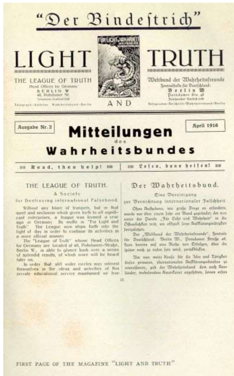
[Illustration: First page of the magazine "Light and Truth"]

through years of struggle. His successor, Wilhelm II, receives the gratitude of America in the form of hypocritical phrases and war supplies to his mortal enemy."