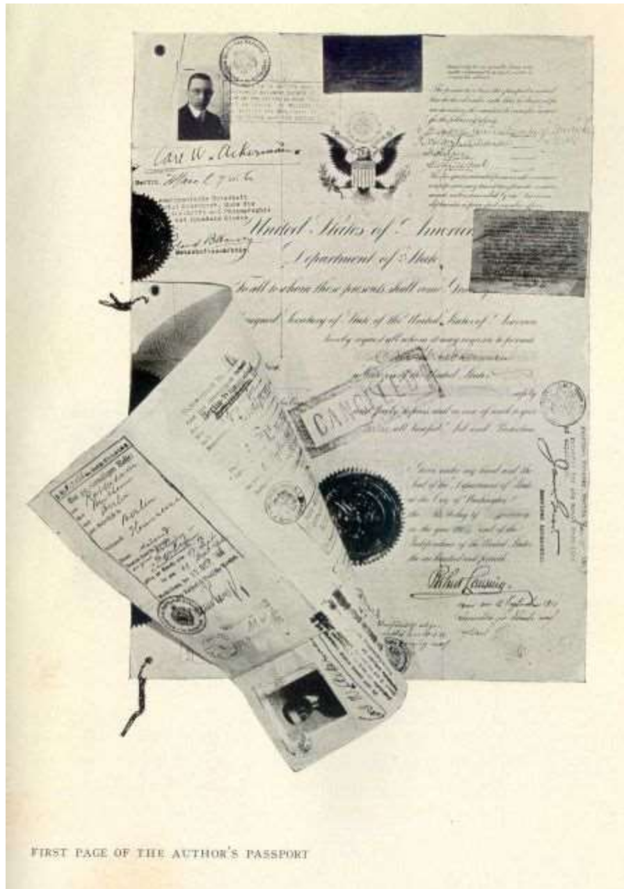
[Illustration: First page of the author's passport.]

" The opinion of the world is the mistress of the world, " he said, "and the processes of international law are the slow processes by which opinion works its will. What impresses me is the constant thought that that is the tribunal at the bar of which we all sit. I would call your attention, incidentally, to the circumstance that it does not observe the ordinary rules of evidence; which has sometimes suggested to me that the ordinary rules of evidence had shown some signs of growing antique. Everything, rumour included, is heard in this court, and the standard of judgment is not so much the character of the testimony as the character of the witness. The motives are