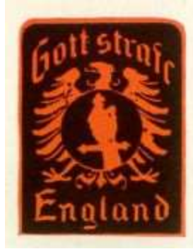
[Illustration: Gott strafe England.]

After the Sussex dispute was ended the Socialist organ Vorwaerts , supported by Philip Scheidemann, leader of the majority of the Socialists, demanded that the Government take some steps toward peace. But the General Staff was so busy preparing for the expected Allied offensive that it had no time to think about peace or about internal questions. When von Falkenhayn resigned and von Hindenburg arrived at Great Headquarters to succeed him the two generals met for the first time in many months. (There was bitter feeling between the two.) Von Falkenhayn, as he turned the office over to his successor, said: