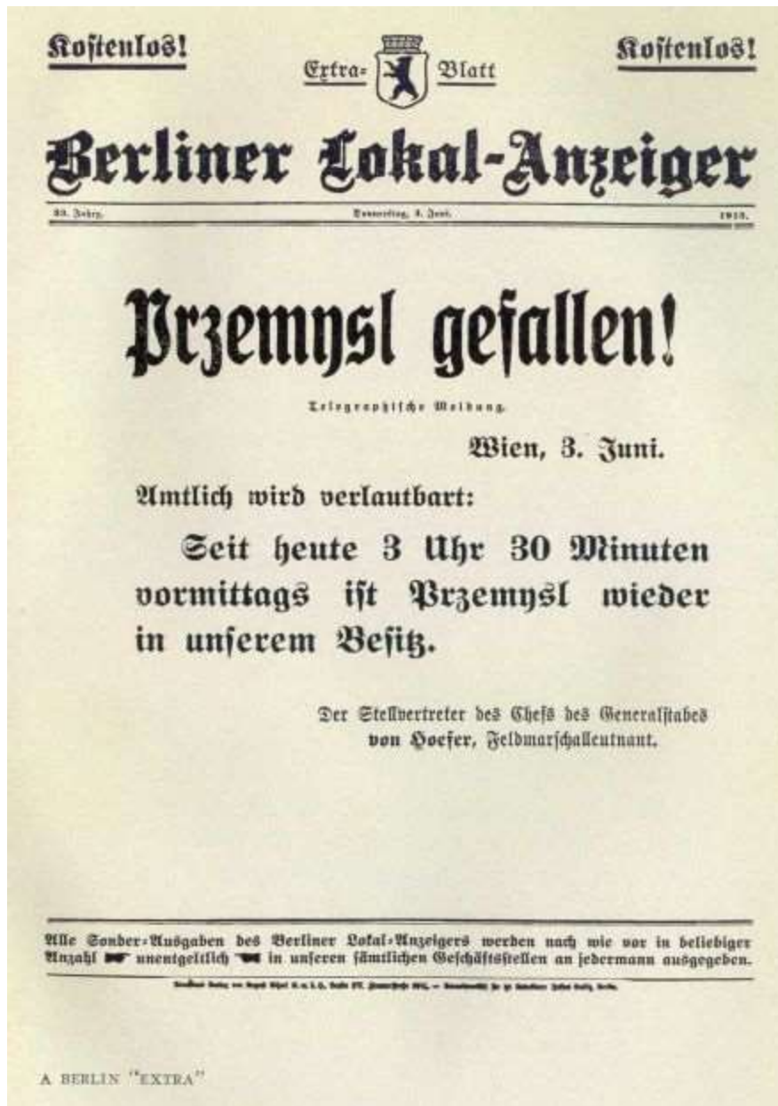
[Illustration: A Berlin "Extra"]

I was in St. Quentin, France (which the Germans on their 1917 withdrawal set on fire) at the headquarters of General von Below, when news came May 8th that the Lusitania was torpedoed. I read the bulletins as they arrived. I heard the comments of the Germans who were waging war in an enemy country. I listened as they spoke of the loss of American and other women and children. I was amazed when I heard them say that a woman had no more right on the Lusitania than she would have on an ammunition wagon on the Somme. The day before I was in the first line trenches on the German front which crossed the road running from Peronne to Albert. At that time this battlefield, which a year and a half later was destined to be the scene of the