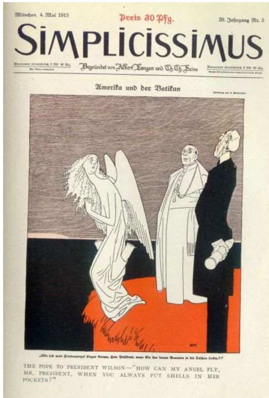
[Illustration: THE POPE TO PRESIDENT WILSON----"HOW CAN MY PEACE ANGEL FLY, MR. PRESIDENT, WHEN YOU ALWAYS PUT SHELLS IN HER POCKETS?"]

This is a typical example of the kind of inspired stories which are printed in the German newspapers from time to time to keep up the confidence of the people. This was particularly needed last fall because the people were depressed and melancholy over the losses at the Somme, and because there was so much criticism and dissatisfaction over the Chancellor's attitude towards the submarine warfare and peace. People, too, were suffering agonies in their homes because of the inferior quality of the food,--the lack of necessary fats and sugar which normal people need