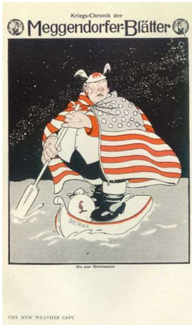
[Illustration: The New Weather Cape]

In the chapter entitled "The Opponent," on page 27 the author says: