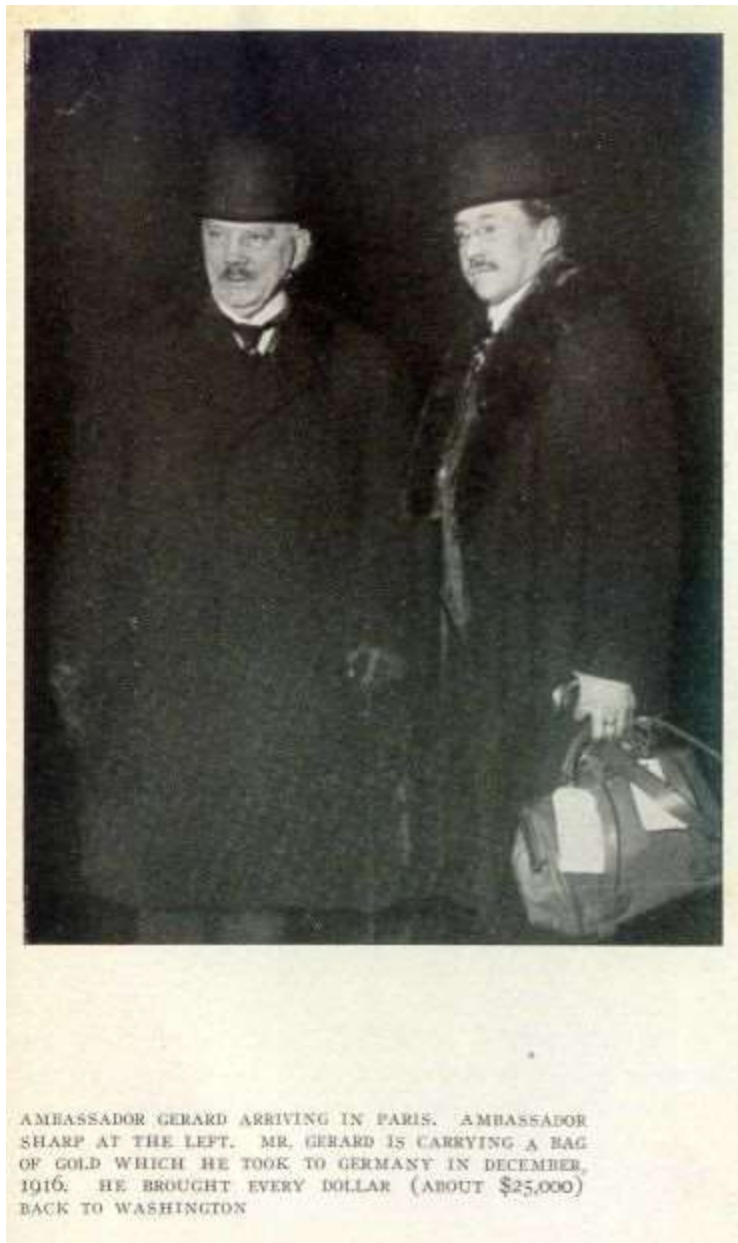
[Illustration: AMBASSADOR GERARD ARRIVING IN PARIS]

During the submarine controversies, when reports reached Berlin that the United States was divided and would not support President Wilson in his submarine policy, Ambassador Gerard did everything he could to give the opposite impression. He tried his best to keep Germany from driving the United States into the war. That he did not succeed was not the fault of his efforts. Germany was desperate and willing to disregard all nations and all international obligations in an attempt to win the war with U-boats.