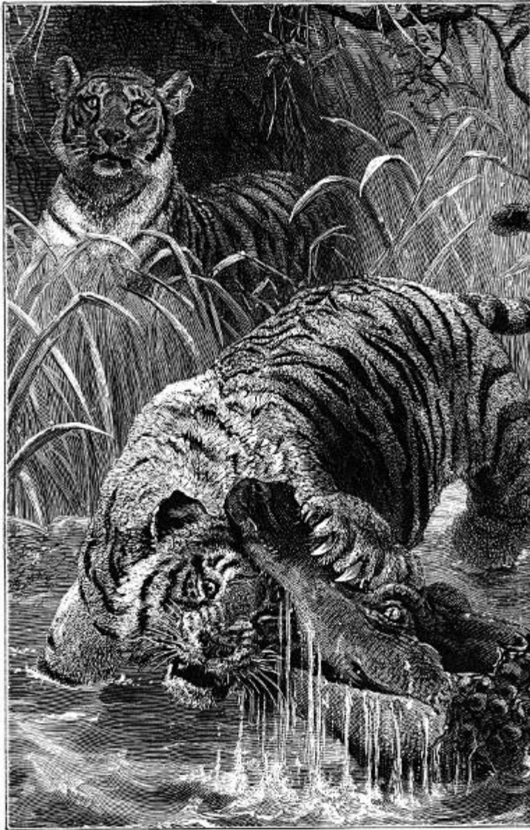
Crocodile and Tiger Fight