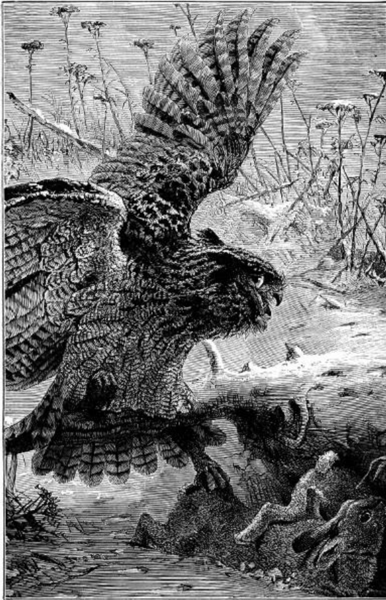
A Hare's-breadth Escape

The Intelligence of the Hare. The following anecdote seems to show remarkable intelligence on the part of a hare. It is from a statement made by Mr. Yarrell in the "Magazine of Natural History":—"A harbour of great extent on our southern coast has an island near the middle, of considerable size, the nearest point of which is a mile distant from the mainland at high water, and with which point there is frequent communication by a ferry. Early one morning in spring two hares were observed to come down from the hills of the mainland towards the seaside, one of which from time to time left its companion, and proceeding to the very edge of the water, stopped there a minute or two, and then returned to its mate. The tide was rising, and after waiting some time, one of them, exactly at high water, took to the sea, and swam rapidly over, in a straight line, to the opposite projecting point of land. The observer on this occasion,