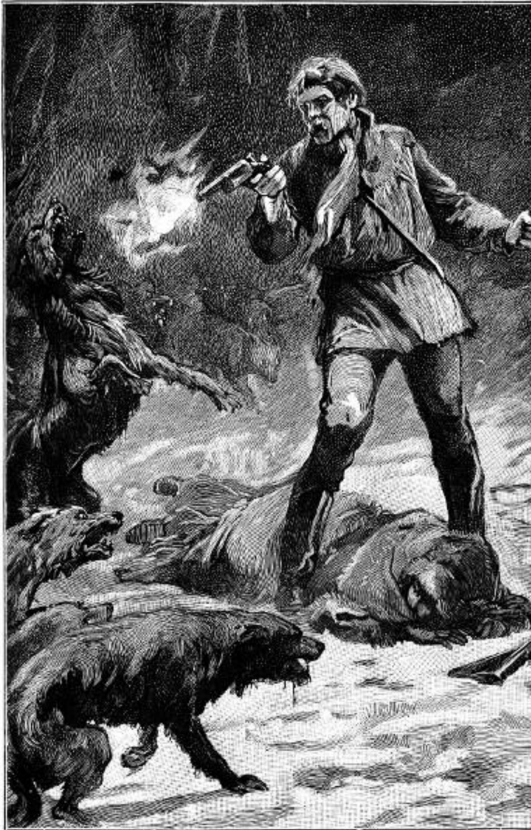
Hunted by Wolves