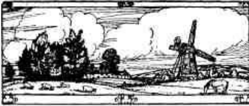
BIRDS IN A CORNISH VILLAGE