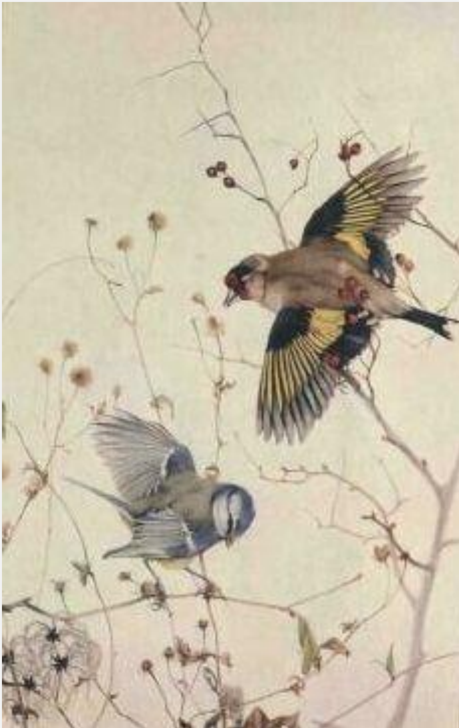
GOLDFINCH AND BLUE TIT.

"The desire for the companionship of birds."