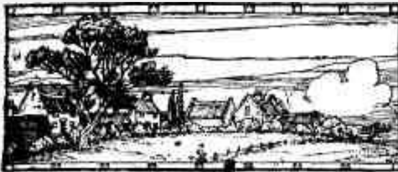
BIRDS IN A VILLAGE I

ABOUT the middle of last May, after a rough and cold period, there came a spell of brilliant weather, reviving in me the old spring feeling, the passion for wild nature, the desire for the companionship of birds; and I betook myself to St. James's Park for the