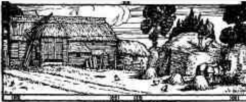
THE EAGLE AND THE CANARY

ONE week-day morning, following a crowd of well-dressed people, I presently found myself in a large church or chapel, where I spent an hour very pleasantly, listening to a great man's pulpit eloquence. He preached about genius. The subject was not suggested by the text, nor did it have any close relation with the other parts, of his discourse; it was simply a digression, and, to my mind, a very delightful one. He began about the restrictions to which we are all more or less subject, the aspirations that are never