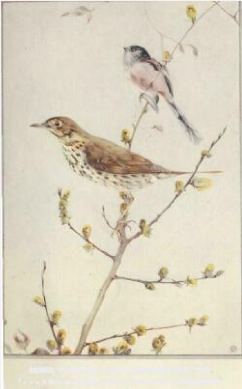
SONG THRUSH AND LONG-TAILED TIT.

" . . . a tree made choice of by a song-thrush as a singing-land"