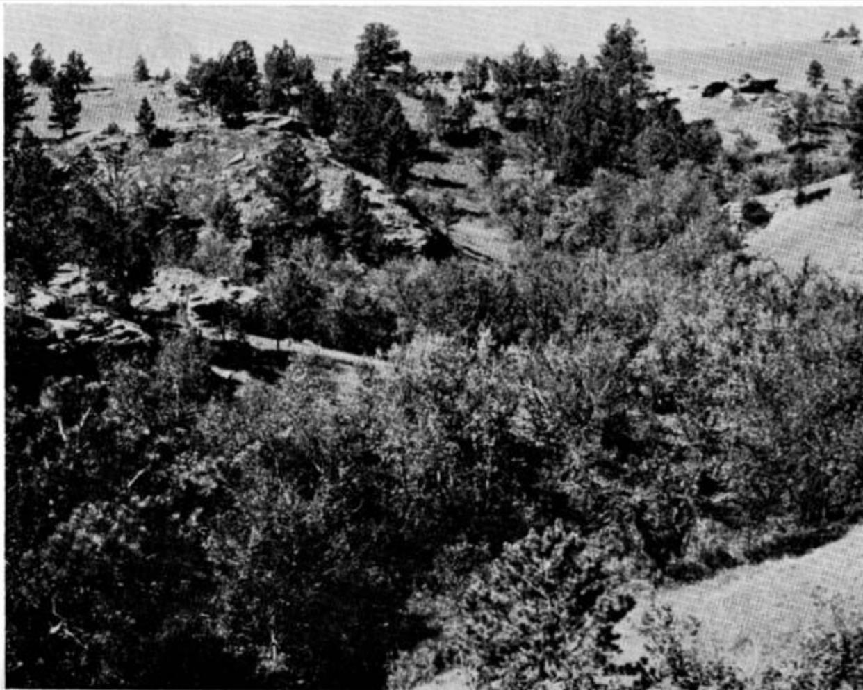
Fig. 6. Draw with deciduous trees in North Cave Hills.