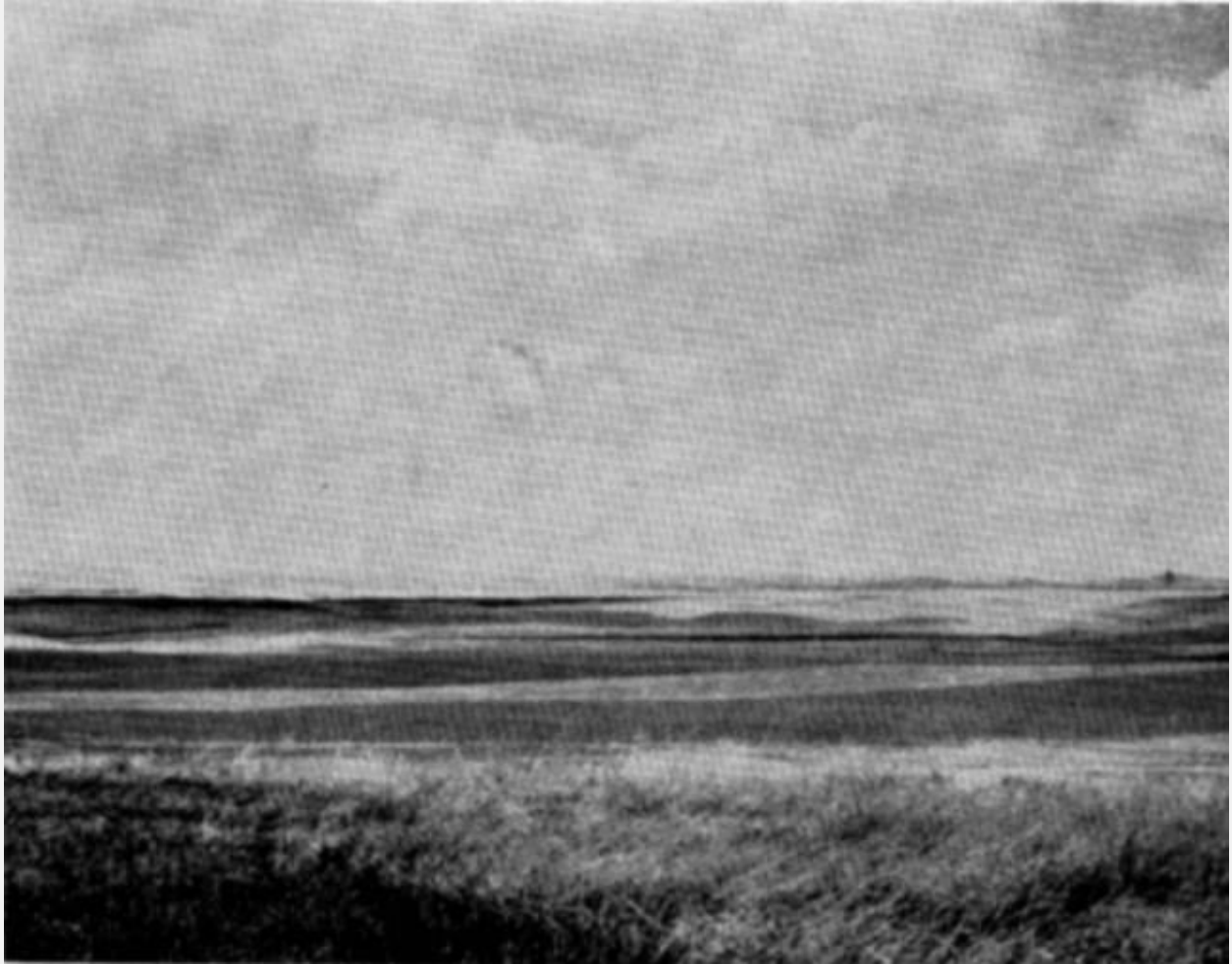
Fig. 8. Farm land in northeastern part of Harding County.