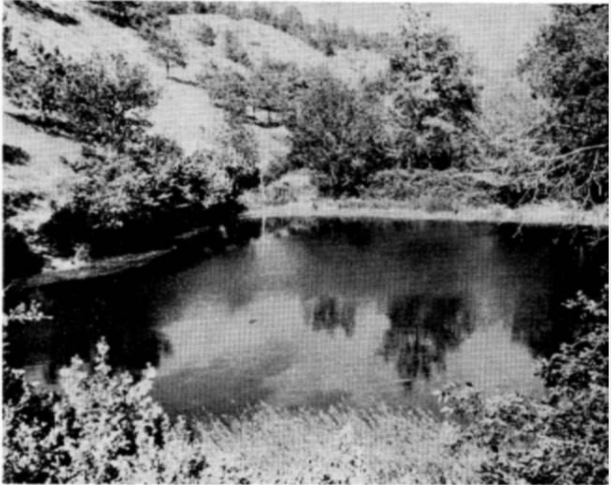
Fig. 7. Spring-fed artificial impoundment in Deer Draw, Slim Buttes.