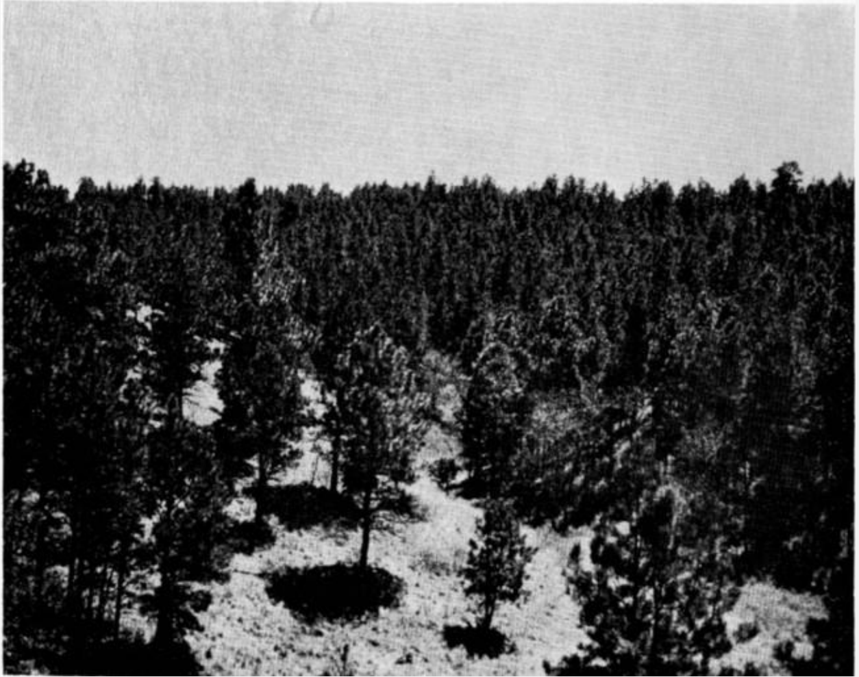
Fig. 5. Stand of pines on northern part of Slim Buttes.