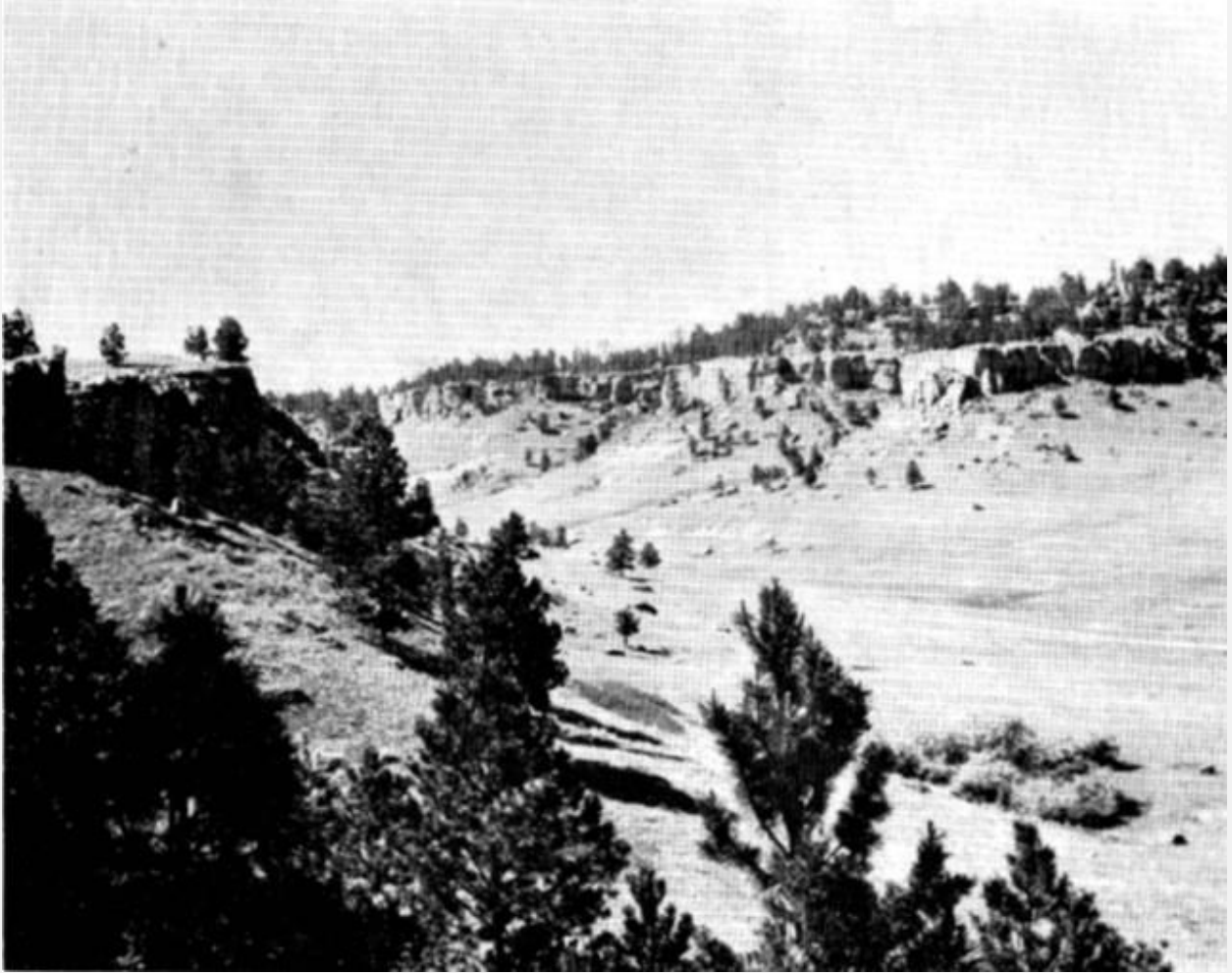
Fig. 3. Fuller Canyon, North Cave Hills.