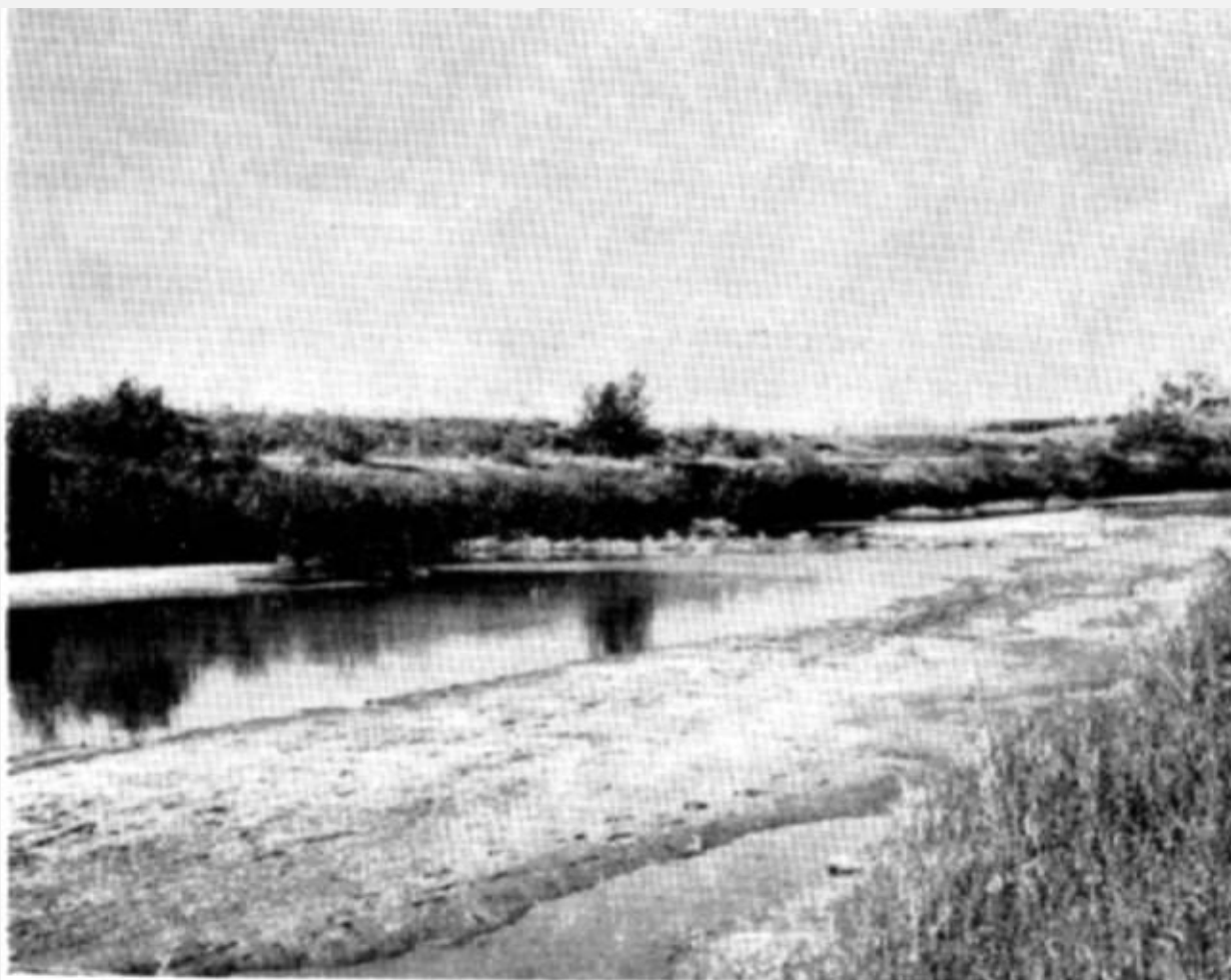
Fig. 4. Little Missouri River southwest of Ladner. Note beaver dam in background and nature of riparian community.