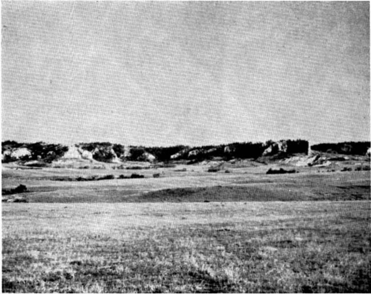
Fig. 2. Central part of Slim Buttes as viewed from the east.

Vegetation of the grassland areas in the county is typical of that found throughout the semi-arid Northern Great Plains. Cover on upland soils, especially those that are clayey in substance, generally is sparse; areas along water courses and well-watered sites elsewhere tend to have denser stands of grasses such as bluestem ( Andropogon ). Dominant grasses of upland are gramma, buffalo grass, wheat grass, stipa, and tickle grass. Sage ( Artemisia ) and numerous forbs are prominent in many areas. These grasslands are used extensively for grazing of sheep and cattle.[Pg 366]