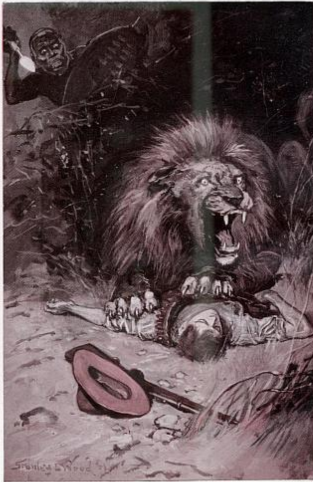
"THE BRUTE COUCHED, SNARLING FIERCELY, WITH THE BOY LYING BENEATH THE OUTSTRETCHED PAWS."

The spot where the feline marauders had been busy