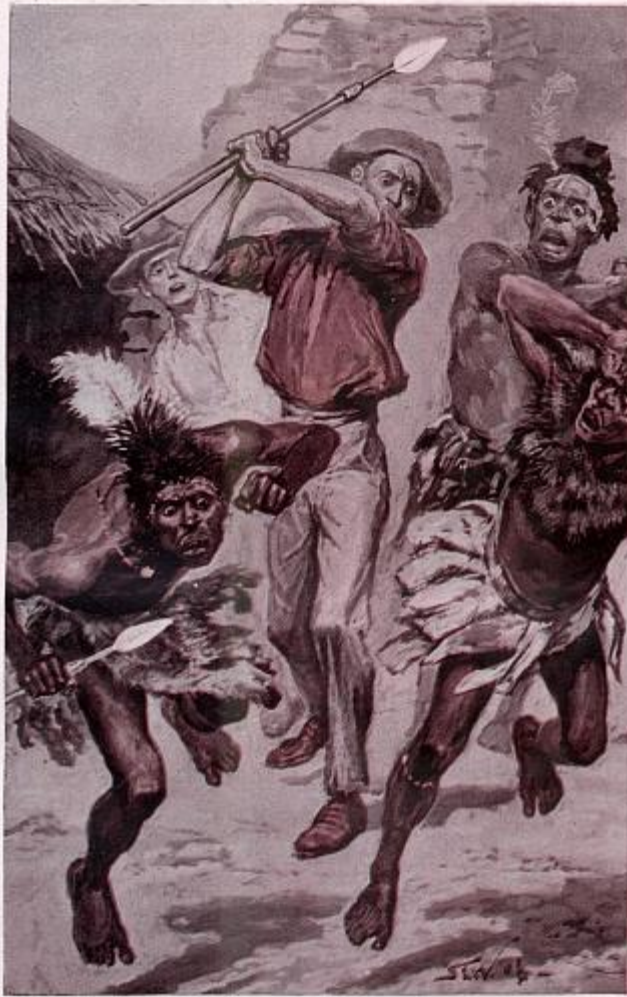
"USING THE SPEAR QUARTERSTAFF FASHION, HE DROVE THEIR ASSAILANTS BACK."

took them down again very much stained, stared at them and uttered a piteous yell.