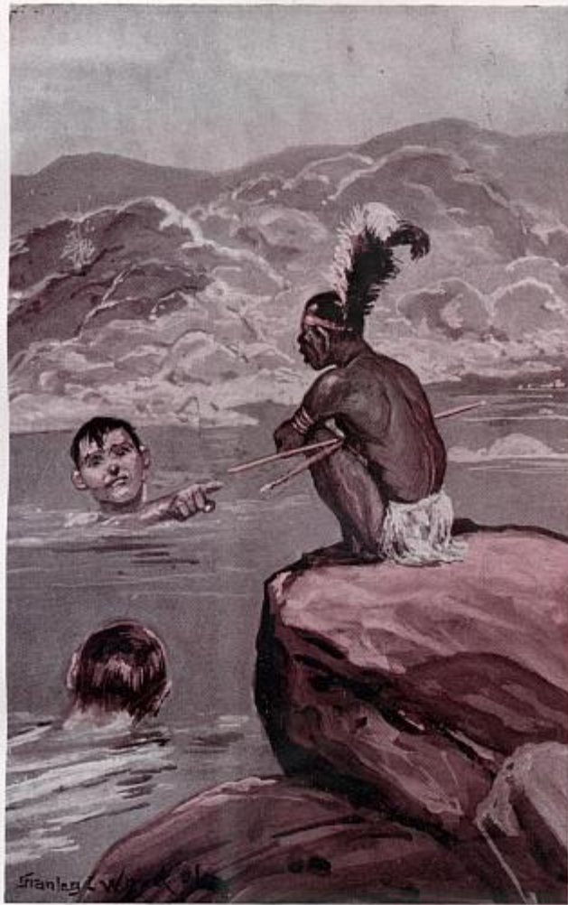
"LOOK AT HIM!" FOR THE PIGMY GRAVELY SEATED HIMSELF UPON A LITTLE BLOCK OF GRANITE, HIS BOW AND SPEAR ACROSS HIS KNEES.

made of india-rubber. Splendid! Why, he has followed us right across this veldt."