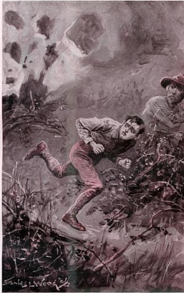
"STARTLED BY THE FIERCE YELL, MARK MADE A DASH FOR SAFETY."

spot where it had fallen, holding out the missing straw at the end of Mak's spear.