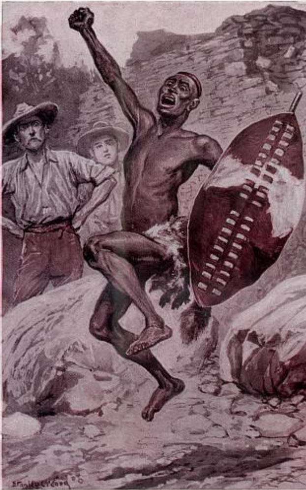
"SPRANG UP AND WENT THROUGH A DANCE OF TRIUMPH."

with which he had treated the spear, some little distance away upon the ground.